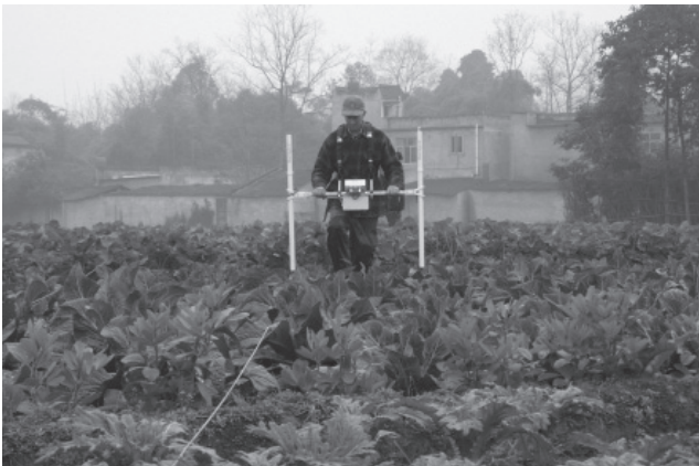
Figure 1: Typical ground conditions for archaeological survey in the Chengdu Plain. The Bartington Grad601-2 dual fluxgate gradiometer is shown here being carried through a field of dense vegetables. The low earthen bank of a paddy wall can be seen running across the foreground.

Further land alteration is due to rapid urbanization in the region. This both threatens the survival of many of these early sites and will also prevent any future meaningful landscape study, highlighting the importance of this current project.