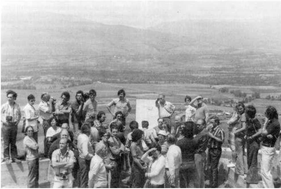
LECTURE IN THE FIELD BY PROFESSOR LLUÍS SOLÉ SABARÍS IN 1976. CELEBRATING THE 50 TH ANNIVERSARY OF THE BOOK LA Cerdanya (1926) BY PROFESSOR PAU VILA (ALSO PRESENT IN THE PICTURE). AFTER THE YEARS OF DICTATORSHIP THE SOCIETY RESTARTED THEIR ACTIVITIES WITH RENEWED VITALITY. LECTURE IN THE FIELD BY PROFESSOR LLUÍS SOLÉ SABARÍS IN 1976. CELEBRATING THE 50 TH ANNIVERSARY OF THE BOOK LA Cerdanya (1926) BY PROFESSOR PAU VILA (ALSO PRESENT IN THE PICTURE). AFTER THE YEARS OF DICTATORSHIP THE SOCIETY RESTARTED THEIR ACTIVITIES WITH RENEWED VITALITY.