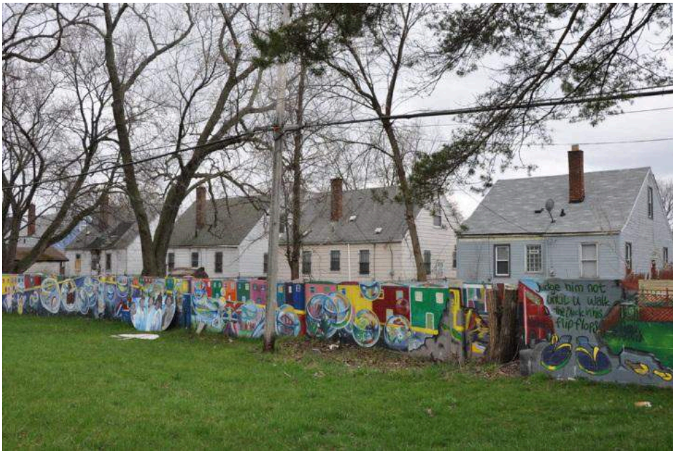
Figure 14. The wall at 8 Mile and Wyoming.