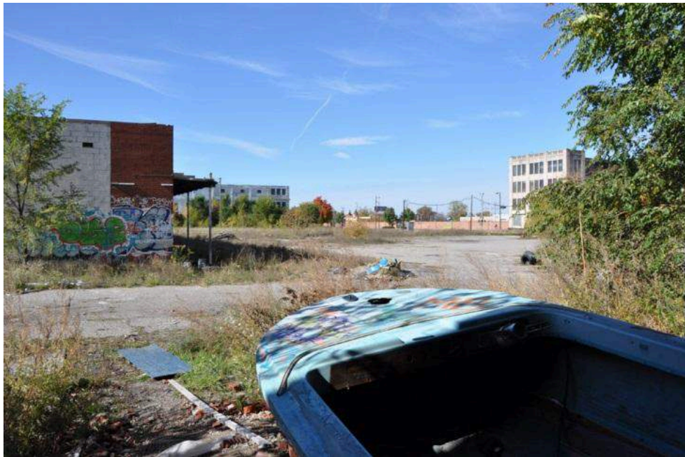
Figure 13. An abandoned boat has somehow managed to get itself into the ruins of the Packard Plant.