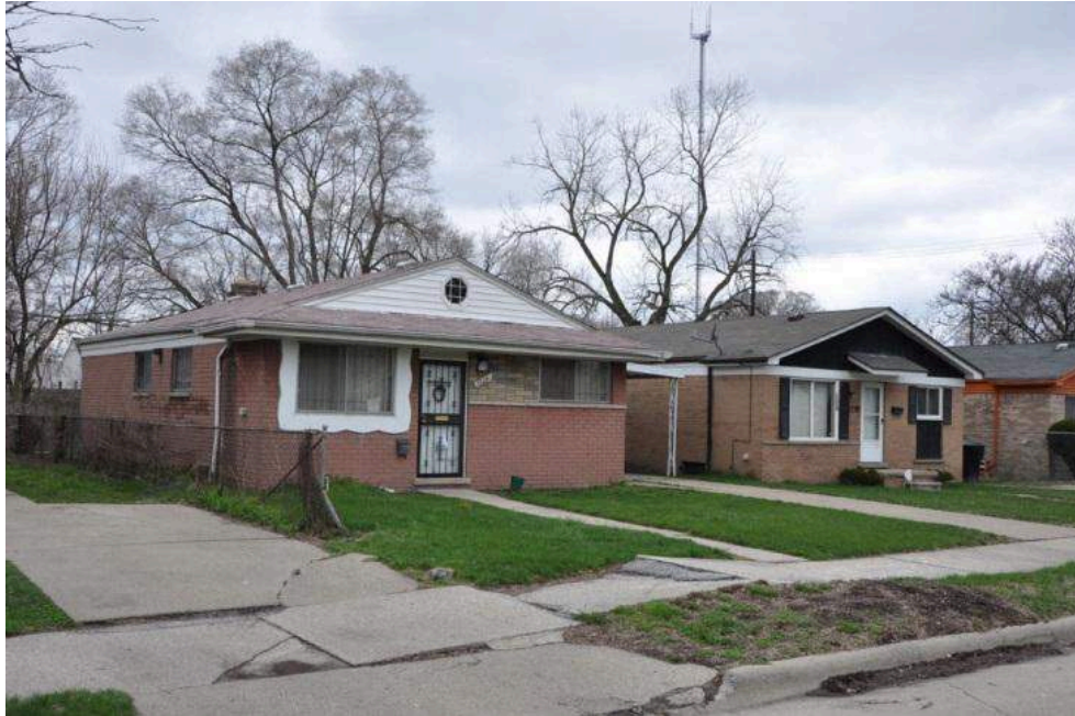
Figure 3. Modest houses such as these enabled ordinary factory workers to live the American Dream. Near 8 Mile and Wyoming.

population, the city was fraught with racism, inequality and overcrowding. Blacks were forced to live in small pockets of substandard housing in the inner-city.