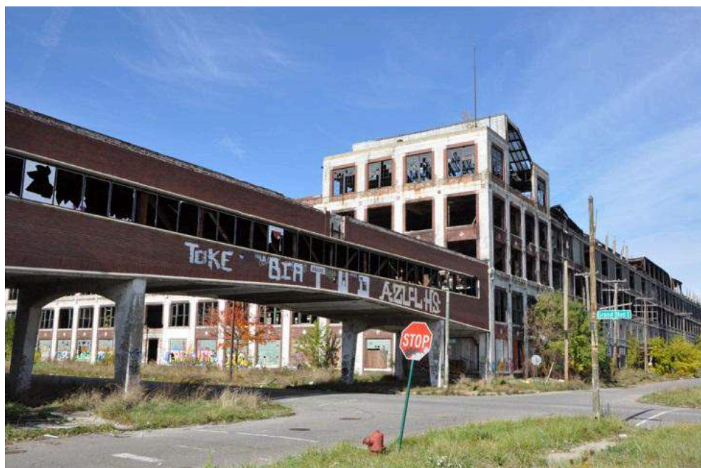
Figure 4. The Packard Plant used to be the largest employer on the East Side of Detroit. Today it is Detroit's largest ruin.