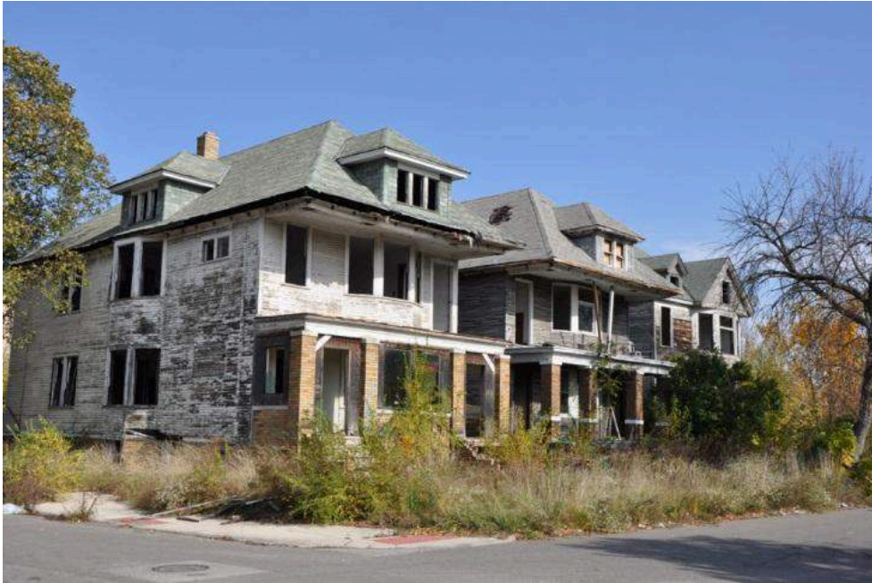
Figure 11. In many ordinary neighbourhoods, abandonment has been rampant and on-going for decades. There are tens of thousands of abandoned houses in Detroit.

2000 (see Figures 11 and 12, Galster, 2012, p. 220-221). He goes on to note that from 1950 to 2005, Detroit lost 29% of its homes, 52% of its people, 55% of its jobs and 60% of its property tax revenue (p. 238). Because there is virtually nothing in Europe which compares to the extreme nature of Detroit's situation, these statistics can only be fully appreciated by visiting and experiencing the city for one's self. The vacant land in Detroit is roughly the size of the municipalities of Leiden and The Hague combined. The remainder of this article describes our four day fieldtrip to Detroit and the experiences which my students had while visiting the city and learning from Detroiters.