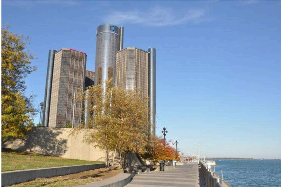
Figure 8. A major attempt to revitalise Detroit was the Renaissance Center, opened in the mid-1970s. In many ways, it had the reverse effect, its self-contained shops, restaurants, cinema, hotel and offices served to create their own bubble, sucking life out of the rest of downtown.

the bankruptcy, the city is still discussing financing a new downtown home for the Detroit Red Wings hockey team. This strategy has been criticised in academic literature as leading to “two speed revitalisation” where the core regenerates as the periphery continues to decline (see Harvey, 2000; MacLeod, 2002; Rodriguez, et al., 2001).