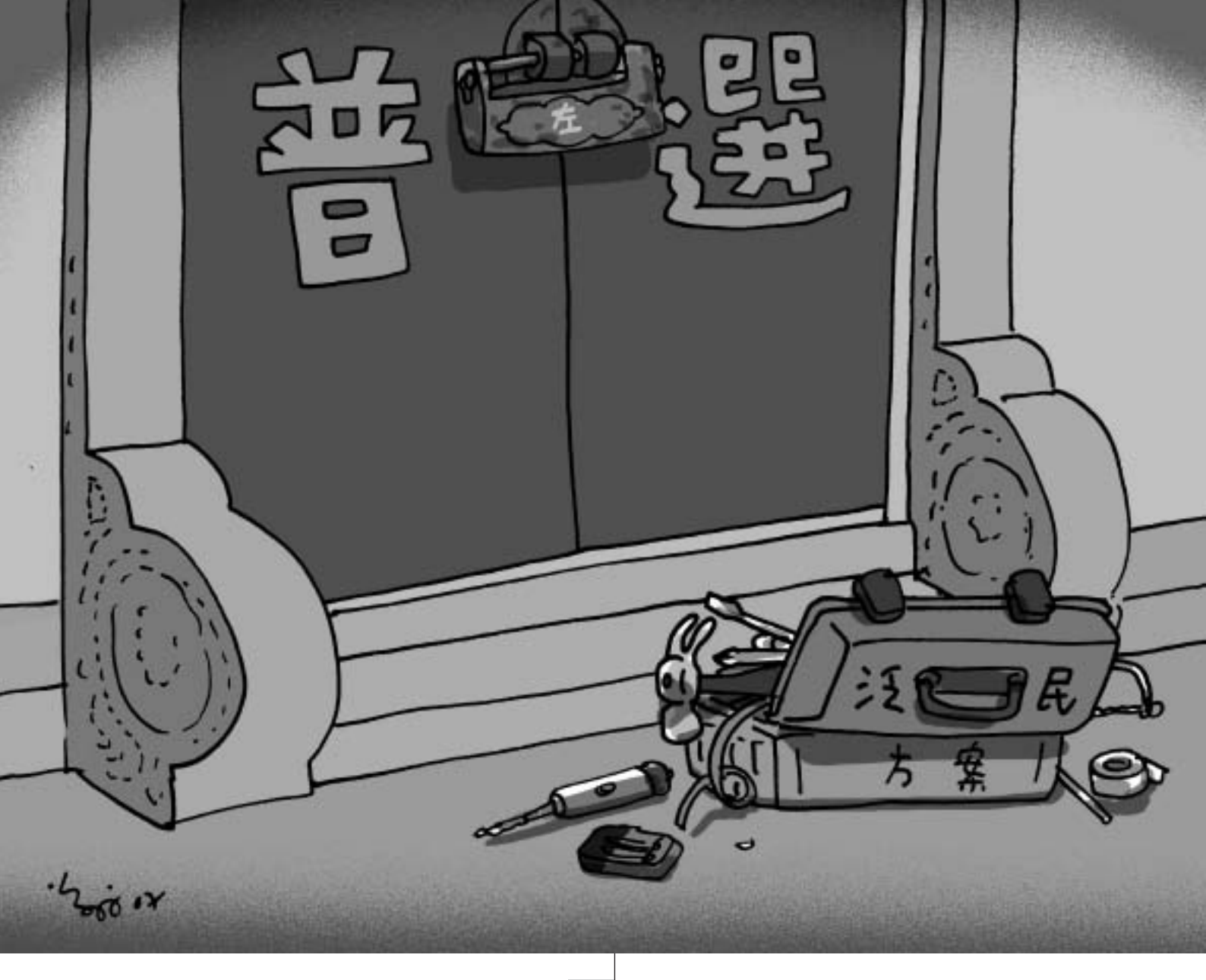
In 2007, democrats have put forward various blueprints for universal suffrage

Committee of the National People's Congress handed down a "decision" that Hong Kong would not be able to elect its chief executive in 2007 and legislature in 2008 by universal suffrage. Hong Kong people were considered to not be ready and reform had to be more gradual. Hong Kong people had not expected such aggressive action from Beijing<sup>(19)</sup>.