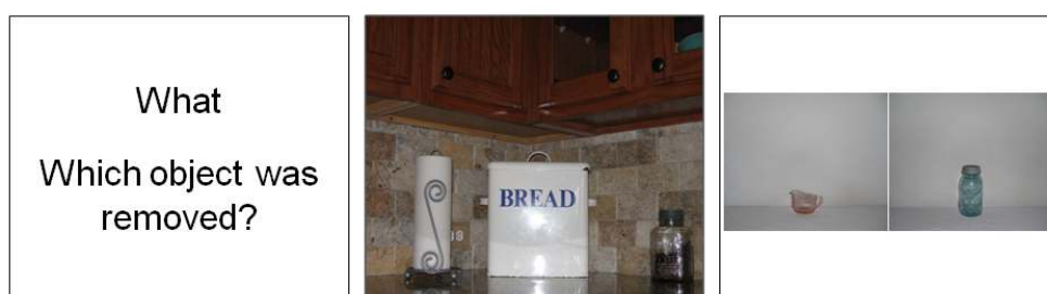
Figure 2. Example of the What condition testing object memory.

Participants were asked "Which object was removed?" and then given 5 trials. The What trials consisted of viewing a previously viewed image with one object removed for 4 s, followed by a choice between two previously seen plausible objects.