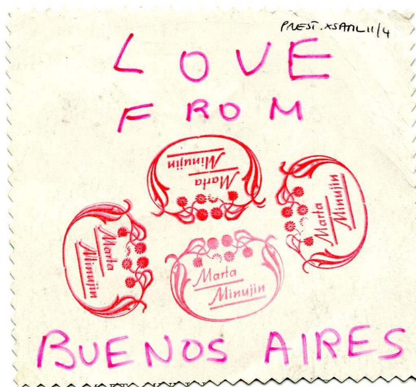
Front and back of a manuscript postcard from Marta Minujín to Pierre Restany, undated, PREST.XSAML.11/4 - Archives de la critique d'art © Marta Minujin