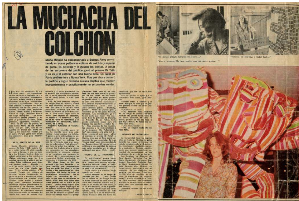
Polimeni, Fanny. « La Muchacha del colchon », in Para Tí , 22 december 1964