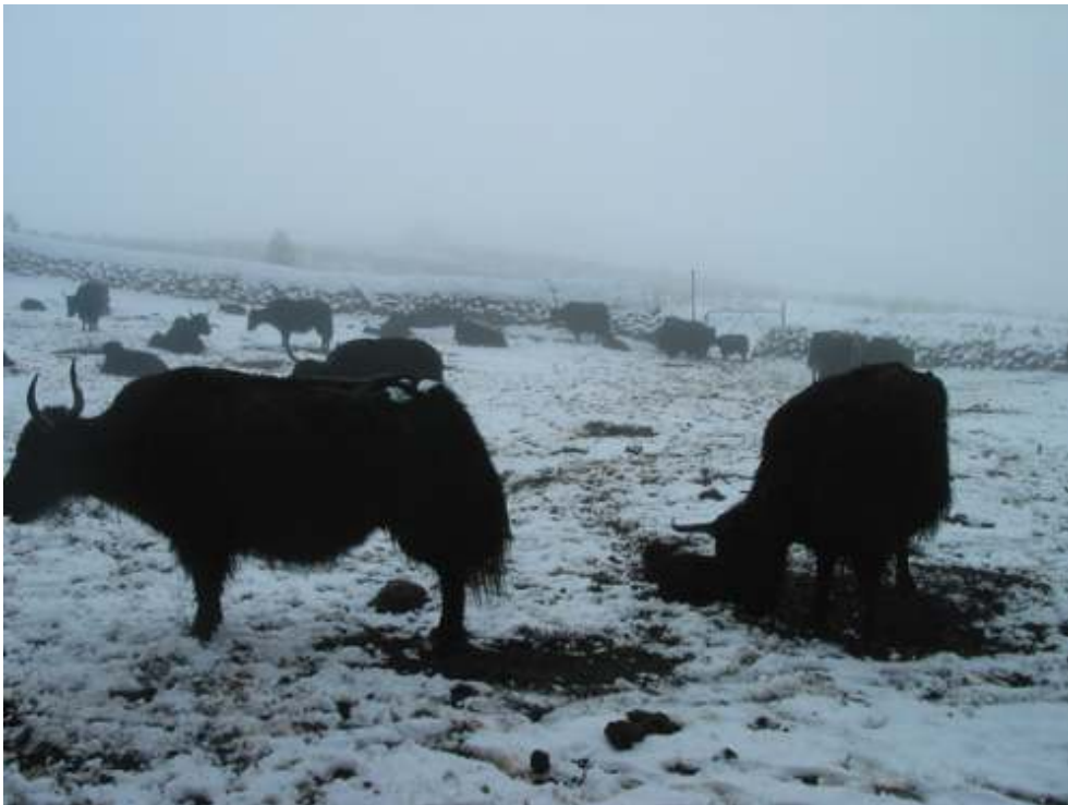
Photo 1. Yaks in spring

(March 2006, Minyag Dora Karmo)