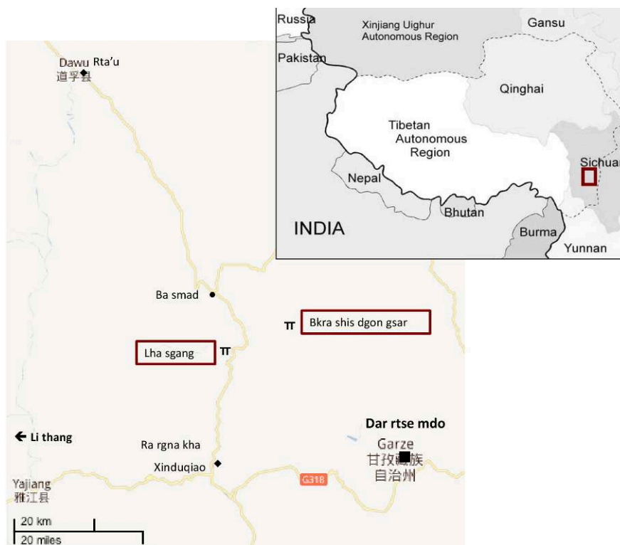
Map 1. Geographical situation of Lhagang, Kham Minyag, in Tibet