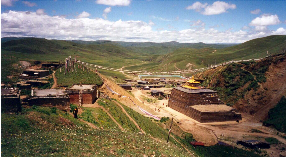
Photo 3. View from the hill above the old temple on the mañi -structure and the nomad quarter in Manijango (2003)