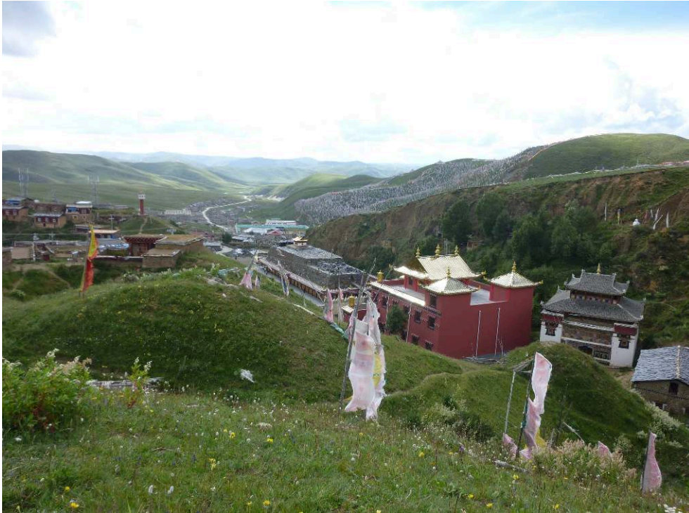
Photo 4. The site of Mañijango with the old and the new temple in the foreground and the village stretching down the valley (2013)