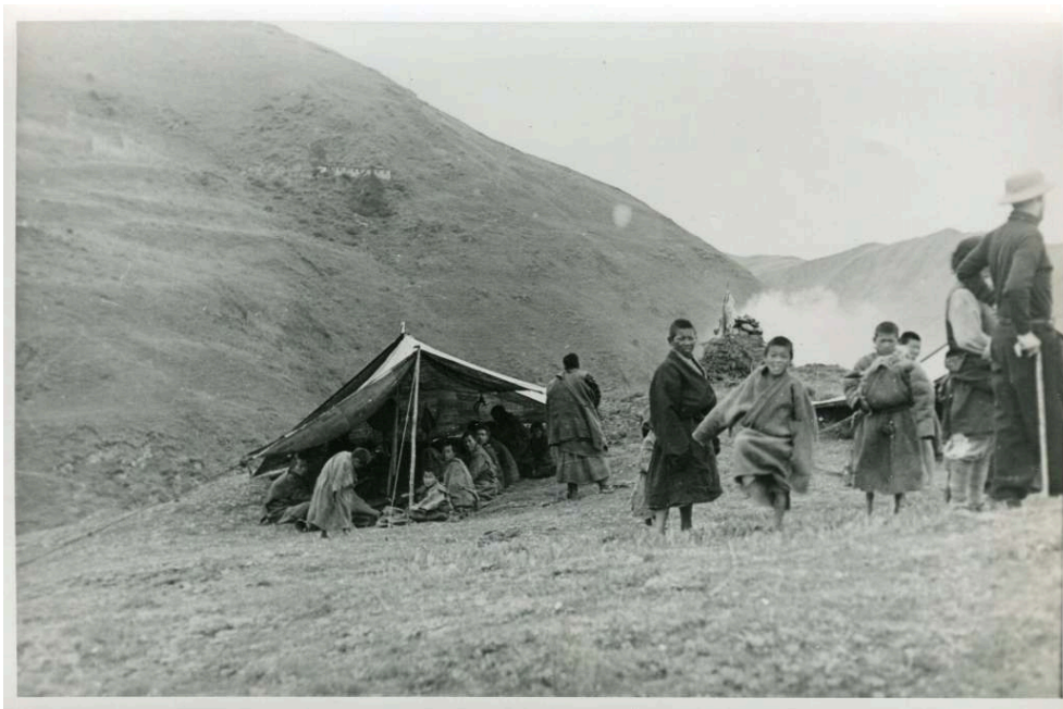
Photo 1. A prayer ceremony in the tent-monastery of Lhagang monastery in 1940