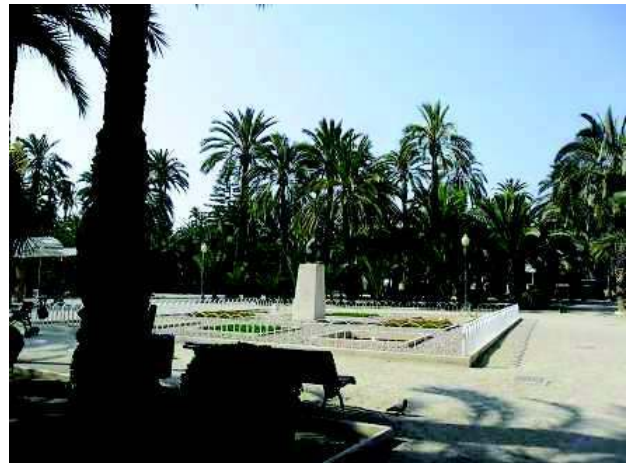
Figure 4 : Former huerto transformed into a park.

At that time, the City Council started to move into a more comprehensive management of the urban Palmeral. This new approach was reflected in the General Urban Development Plans of 1986 and, specially, 1998. Among the new measures 44 , it is worth mentioning the acquisition by the Local Government of non-transformed private huertos in order to turn them into public spaces. As a result, the main alteration undergone by the urban Palmeral during the last years of the twentieth century was the transformation of huertos into public parks and gardens 45 . However, this measure has not been totally consistent with the heritage protection, as some actions have affected their agricultural nature. In that regard, traditional elements of this agrosystem have been eliminated or modified, and others related to their new recreational function, like urban furniture, have