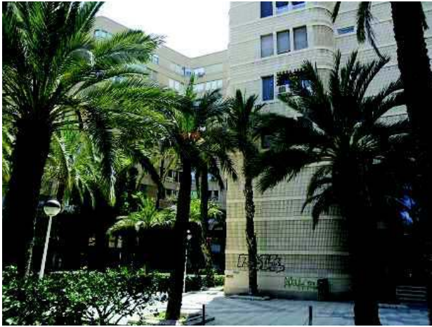
Figure 3 : Huerto occupied by a residential building.

classified as social huertos , which were allowed to house a diverse range of activities: artistic gardens; schools; health, sport and religious facilities; hotels, or houses. The aim was to use these former agricultural spaces for social infrastructure in order to meet the needs of a growing population living in an area with a high urban density. However, the inadequate distribution of these social huertos led to the fragmentation of the historic Palmeral. These regulations implied the urban invasion of the huertos , being greatly affected by the construction of public and private buildings 41 .