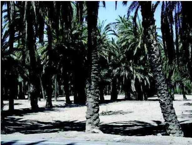
Figure 5 : Huerto with no agricultural function.

Currently, about two thirds of urban huertos are owned by the City Council. Their recovery and maintenance involve a significant economic burden, which is mainly borne by the municipal authority. It has been suggested the development of certain activities in these spaces, conducted also by the private sector, which may be a factor to attract visitors and ensure the economic sustainability of this cultural landscape. This proposal, which is not free of controversy, must be consistent with the objective of enhancing the urban huertos in their original configuration as agricultural land. In this regard, the Special Protection Plan for the Palmeral proposes the allowance of provisional constructions destined to house tourist and leisure activities and others related to the spreading of the culture on this agrosystem, like interpretation centres, exhibitions, workshops on traditional craft or the sale of huerto products, provided they do not affect its physical structure 57 .