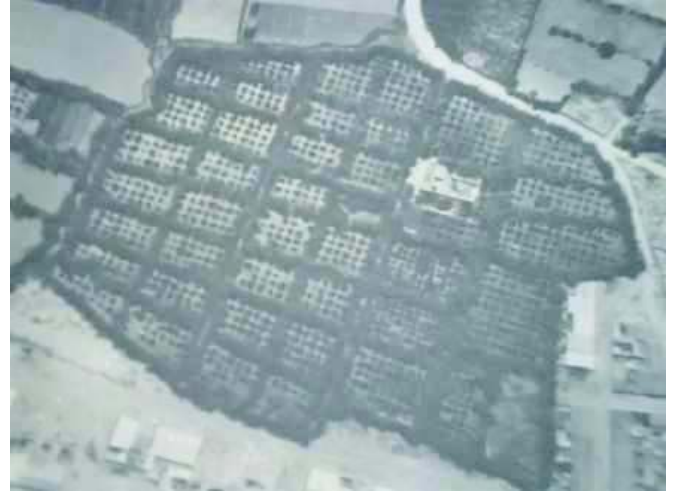
Figure 1 : Huerto with agricultural function.

purposes: the white palm, obtained after the application of traditional techniques to the palm tree, plays a major role in the Palm Sunday procession at Easter. Furthermore, it provides materials like wood and fibres, which have been used as construction elements. It is also worth mentioning the high ornamental value of this plant 14 .