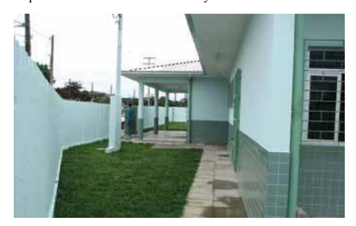
New Health Care Center