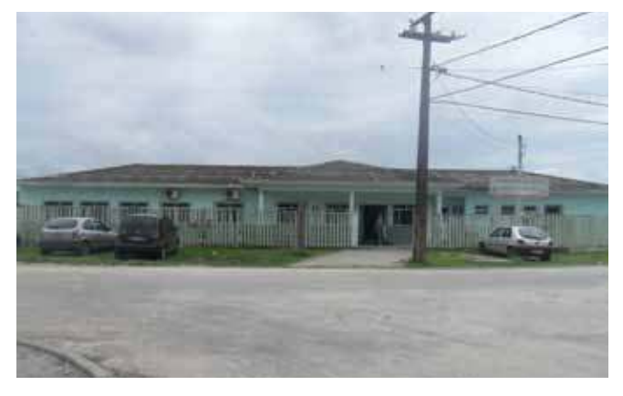
Day Care Center, capacity for 150 children.