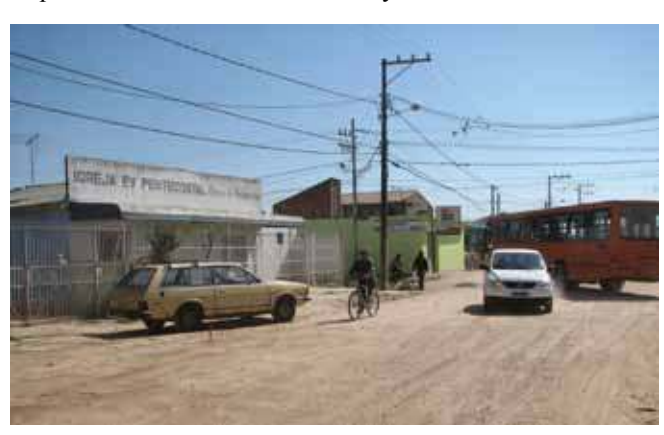
Implementation of Formal Water System