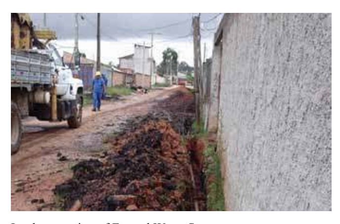
Implementation of Formal Water System.