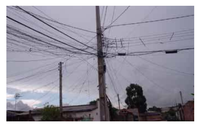
Makeshift Water Lines Improvised by Community Residents