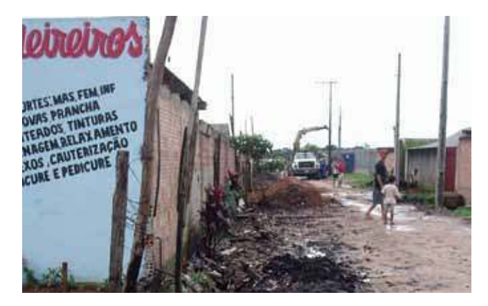
Makeshift Water Lines Improvised by Community Residents