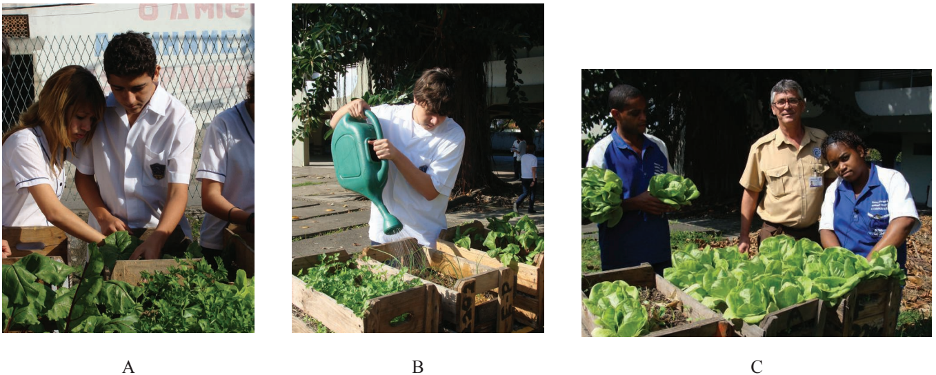
Figure 3. Pupils cultivate the school vegetable garden in crates and employees participate in the harvest.

on how they accept the relevance of such actions to their lives. Despite the contradiction identified by the questionnaire, the pupils did not readily see themselves as contributing towards environmental degradation. This probably relates to the difficulty in changing habits, since usually we only change if we acknowledge the need to change our attitudes, unless we are forced to do so. These findings also suggest that individuals also find it difficult to identify themselves as agents of environmental degradation. There is still resistance towards recognizing the importance of individual actions in achieving collective results, thereby contributing towards improving environmental conditions. For Jacobi (1997), it is necessary to create new attitudes and behavior given our society's consumption and to stimulate changing individual and collective values. This is reinforced by Sorrentino (1998), who sees the major challenges facing environmental educators as, on one hand, restoring and developing values and behavior (trust, mutual respect, responsibility, commitment, solidarity and initiative), and on the other hand, stimulating an overall and critical vision of environmental issues and promoting an interdisciplinary focus on restoring and building knowledge.