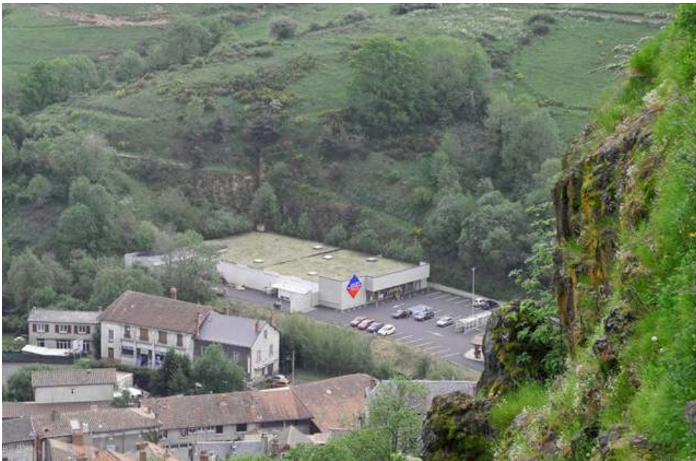
Fig. 2. France #01

© Michel Houellebecq. Courtesy of the artist and Air de Paris, Paris. (Part of Carré de Baudouin Press Release).