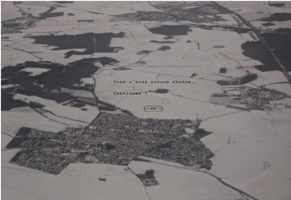
Fig. 1. Mission #001

© Michel Houellebecq. Courtesy of the artist and Air de Paris, Paris. (Part of Carré de Baudouin Press Release).