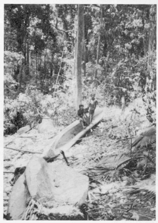
PHOTO 2. THE LOG IS HOLLOWED OUT IN THE FOREST UNTIL THE HULL TAKES SHAPE, THEN IT WILL BE HAULED OUT FROM THE FOREST