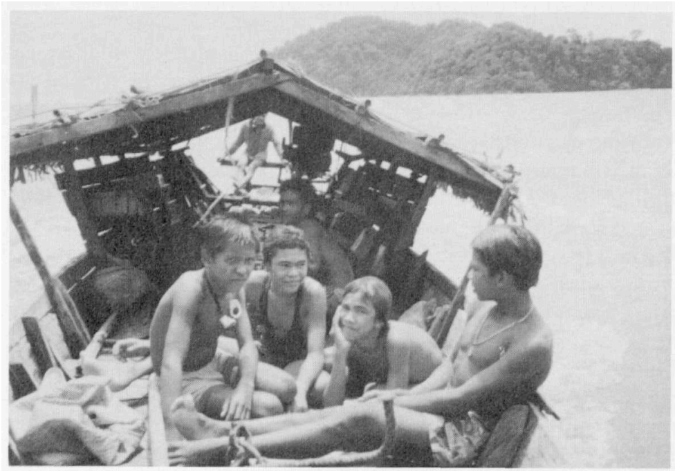
PHOTO 1. MOKEN ALL-MEN EXPEDITION TO ISLANDS WITHIN THE SURIN ARCHIPELAGO

joins in this event with « oh hela, oh oh hela » or beautiful rhythmic calls to harmonize the tugging and towing of this hollowed log. Smaller logs for the chapam may be hauled to shore and hollowed out on the beach. Then, the slow fire is built under the dug-out and after the wood becomes softer and more flexible by the heat, the sides are stretched out and widened. The firing and hollowing are repeated until the dug-out is wide enough to serve as a boat hull. Each step of boat making is a difficult task in itself, one that requires skills, strength, patience, and faith! A few Moken broke their hollowed logs during the down-hill hauling, and a few cracked their boat during hull-stretching and widening (photo 2).