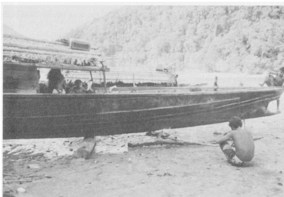
PHOTO 3. A MOKEN MAN PUTS A SMALL FIRE UNDER HIS BOAT TO RID OFF ALGAE WHILE HIS WIFE IS COOKING ON THE BOAT AND HIS DAUGHTER IS CLIMBING UP THE PROW STEP