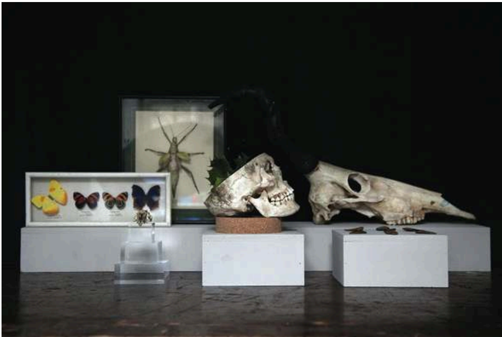
"Aklo signs (winter)"