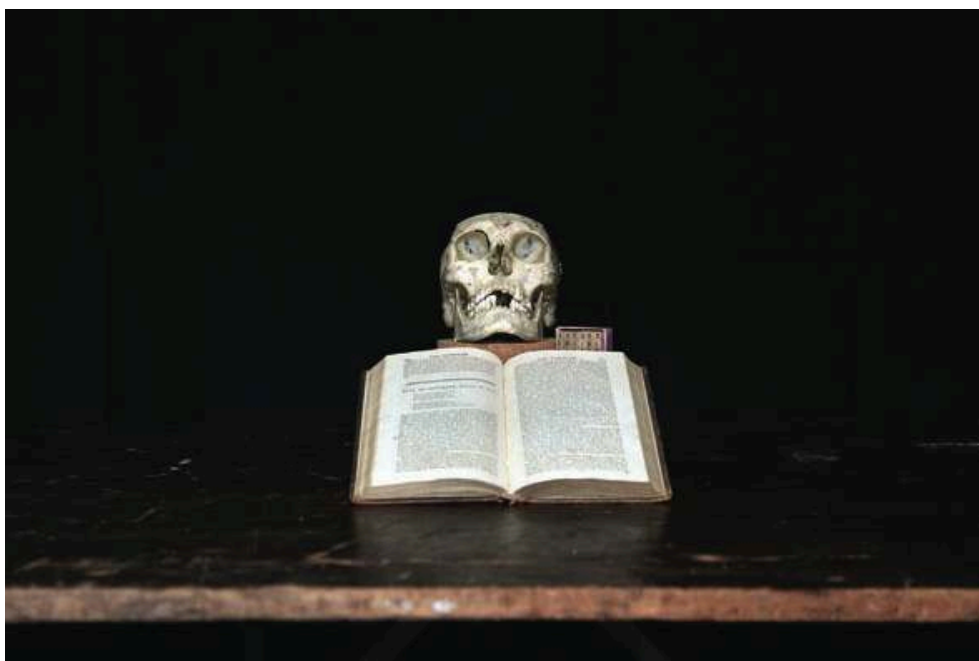
“Word of mouth”