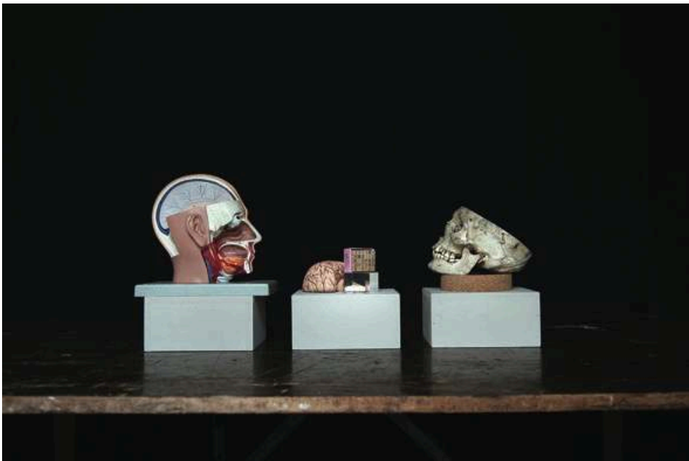
"Culture is about symbols"