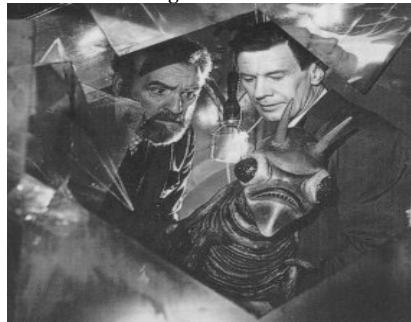
Plate 2: BBC version of the Martians