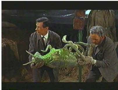
Plate 1: Green gore in the film version

devil rising hugely against the London sky cannot help triggering memories of white atomic clouds and post-world-war-II angst. It is all the more efficient as its appearance has been built throughout the film on the dialectics between underground forces of the past and cosmic threats of elimination, in keeping with Gothic vertical aesthetics. Contrary to the TV serial where the excavation was carried out at ground level and the artefact was found lying horizontally, the film locates the capsule deep in the London underground, at Hobb's Lane tube station. This shift creates a totally different sense of space, including numerous high- and low-angle shots taken in the pit and many darkened shots typical of Gothic aesthetics. The depth of the drilling allows very slimy earth to be shovelled out in order to unearth the space ship. The sheer primitive physicality of the location is made much more impressive and paves the way for the horrifying bodies of the insects, which putrefy under our gaze the minute they are exposed to open air, in true Lovecraftian manner. Baker makes extensive use of colour here: greenish fluid oozes out of the Martians' bodies, turning everybody's stomach inside out (see plate 1). The TV insects looked much more civilized (see plate 2).