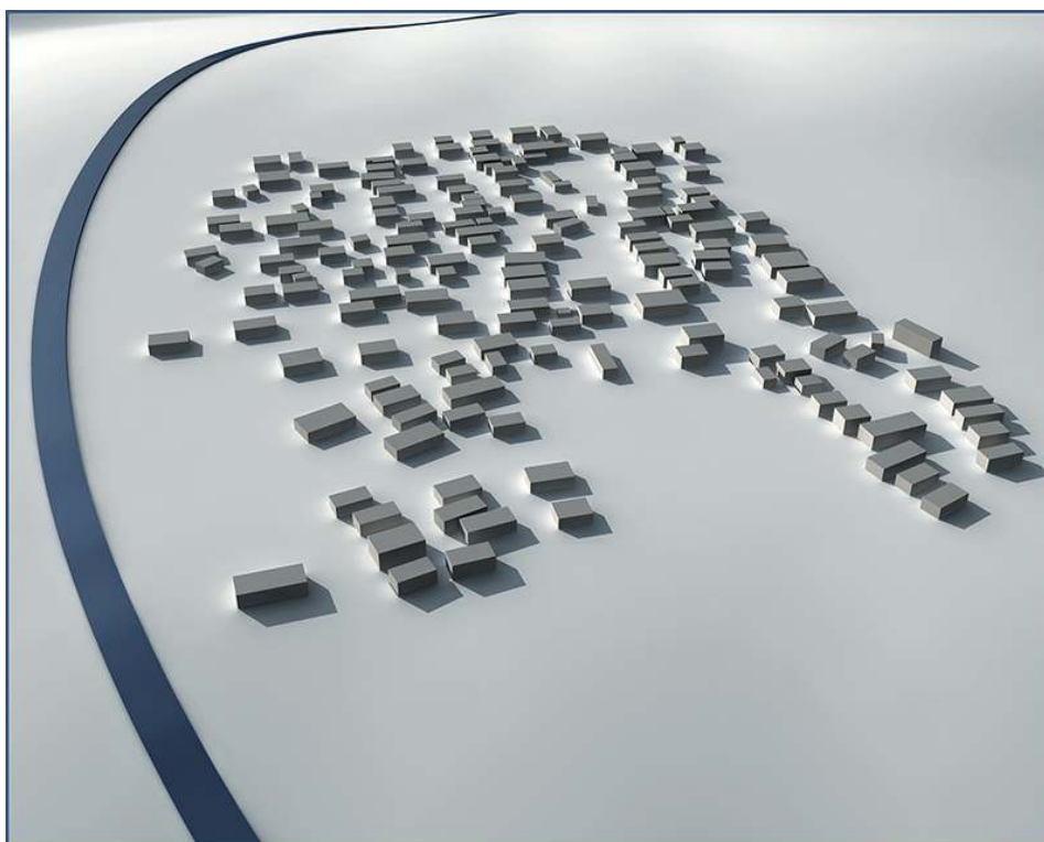
Fig. 2 –Ideal reconstruction of the Stubline settlement