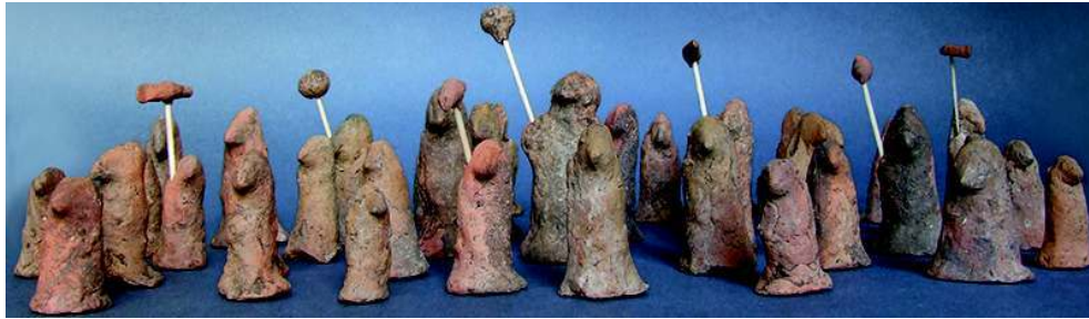
Fig. 4–Figurines from Stubline