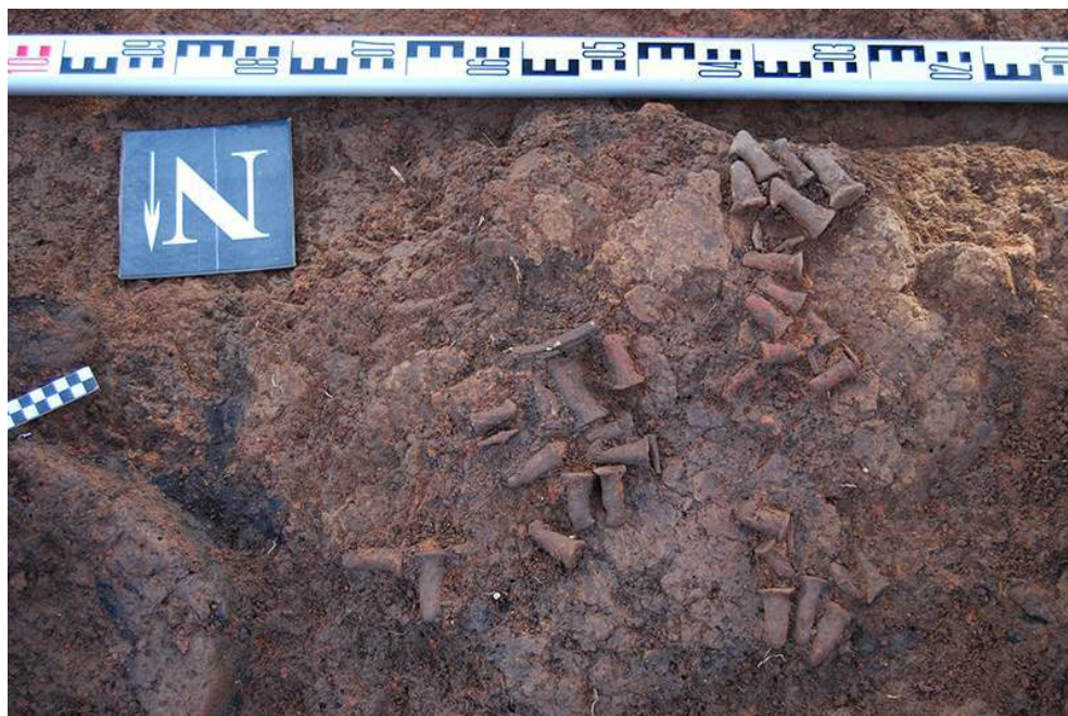
Fig. 3—Figurines from Stubline in situ