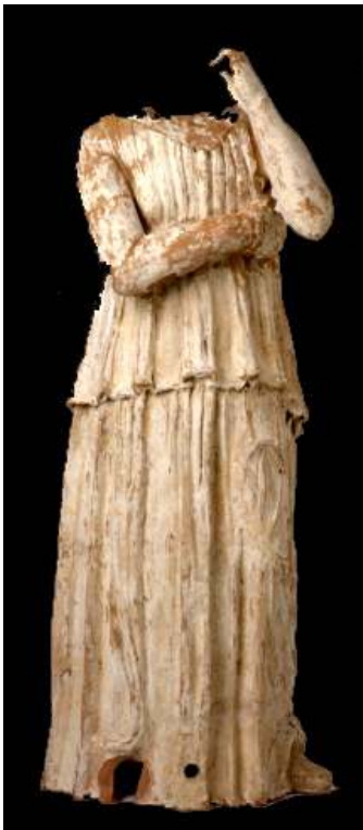
Orante 1, from Canosa. WAM, after restoration.