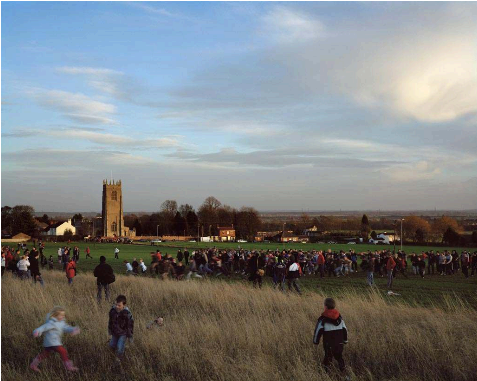
Figure 2: Simon Roberts, ‘Haxey Hood’