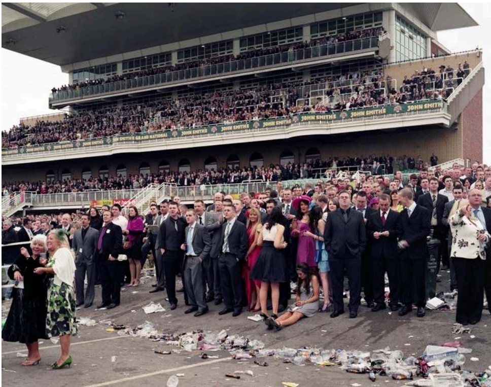
Figure 3: Simon Roberts, 'Derby Day at Epsom'