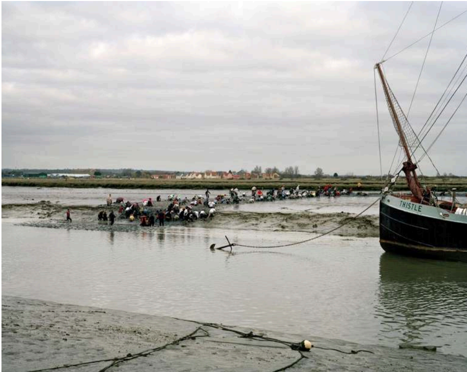
Figure 4: Simon Roberts, ‘Mad Maldon Mud race’