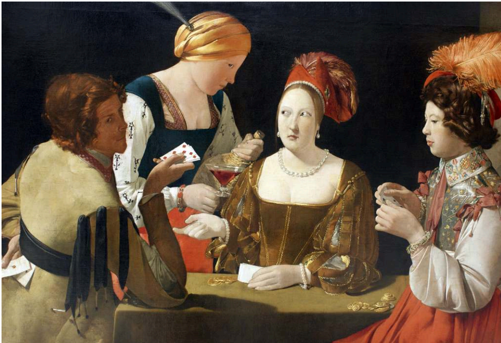
Figure 1: Tricheur à l'as de carreau (1635) by Georges de La Tour (1593-1652)

Louvre Museum. Source: https://commons.wikimedia.org/wiki/File:La_Tour_Le_Tricheur_Louvre_RF1972-8.jpg