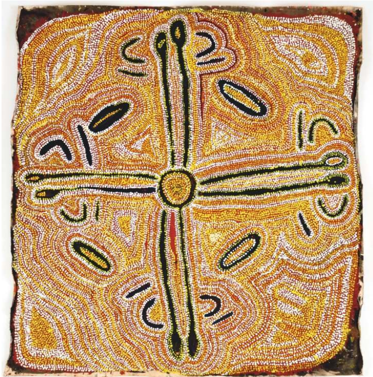
Yumurrpa Yarla [site of the Yam Dreaming], 1991, acrylic on canvas by Yulyulu Napurrurla, 124x124cm