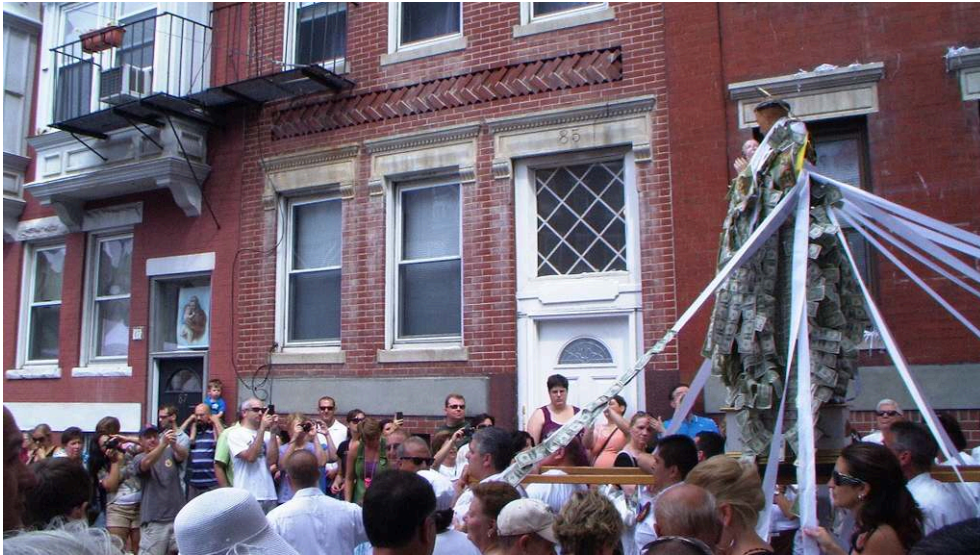
Figure 1. Boston, North End, August 2011.