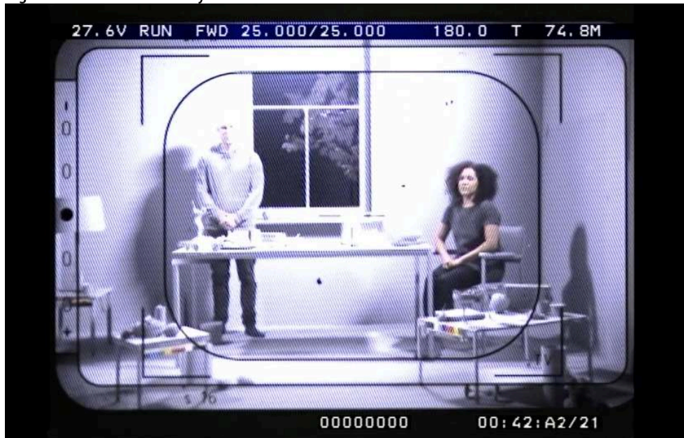
Figure 6. Still of the scene by An van. Dienderen for PRISM

Video link = https://vimeo.com/269717694