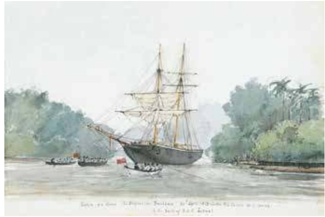
Fig. 4: Illustration of the capture of the brigantine Paulina by the boats of HMS Linnet , sketched by Captain Henry Need, 1853. The boat in the foreground clearly lacks a transom, a key marker of a whaleboat.

Exposure between the naval and whaling fleets occurred at least as early as the wars in North America in the mid-18 th century, however, adoption of the whaleboat as a naval craft does not appear to have occurred until much later. Eighteenth century use of whaleboats in North America as raiding, smuggling, and transport craft differs significantly from the use of the whaleboat as a ship's boat in the 19 th century. Mentions of whaleboats as a ship's boat fall into three main categories and are clustered from the 1840s to 1860s, with some limited examples from 1818 through the 1830s. The use of whaleboats in the Arctic, West Africa and the Pacific all suggest that whaleboats were first utilised on specialised expeditions into existing whaling grounds. The numerous examples of whaleboats in these locales suggest that the introduction of whaleboats was