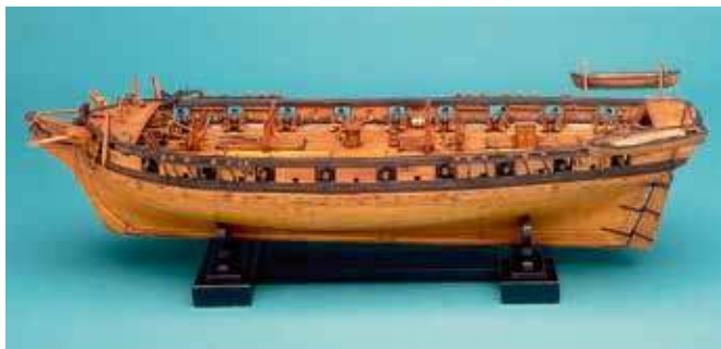
Fig. 2: Model of an 18-gun brig of the Cruiser class, showing a whaleboat on the starboard side, 1810 (National Maritime Museum, Greenwich, London, SLR 0348).

The Arctic is an area in which it seems adoption of the whaleboat happened early, perhaps a result of Captain Broke's experience guarding the Greenland whaling fleet in 1808. Ross's orders from the Admiralty specifically mention the importance of relying on the expertise of whalers: