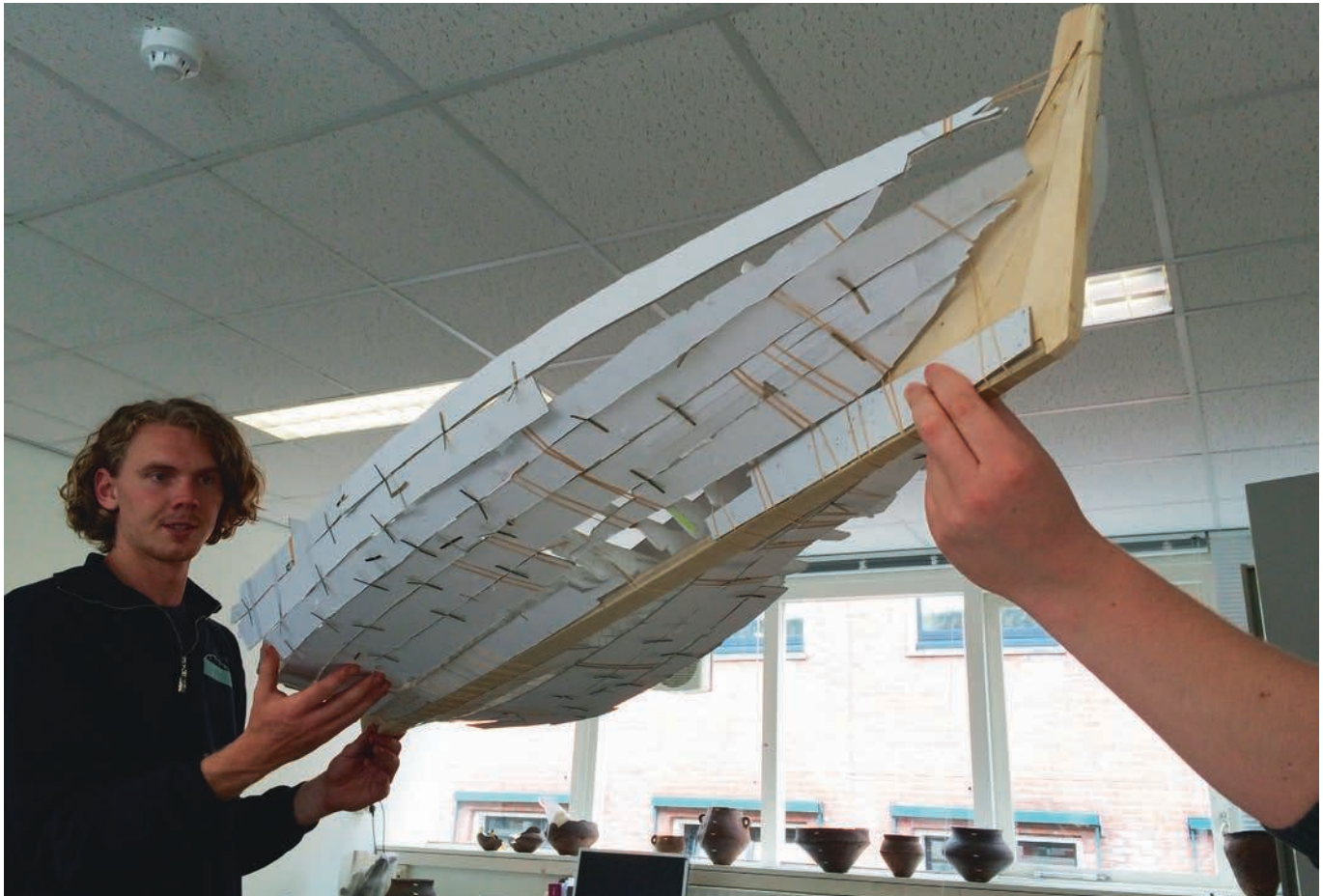
Fig. 3: Model of shipwreck OE 34, Flevoland, Netherlands, showing the slender hull form in the stern.

transferred by travelling craftsmen and engineers (Epstein 2013, p. 54-55). And that is exactly what guilds stimulated.