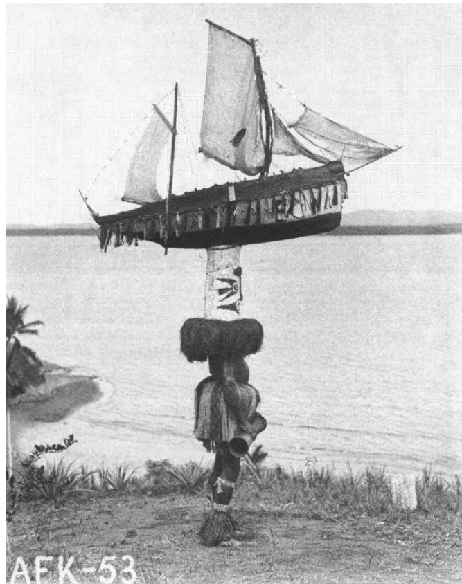
Fig. 1: Man from Papua New Guinea wearing an eharo mask topped by an effigy of a ship (after Davies, Taçon, 2013, p. 114).

From the 6 th century BC onwards people of the coastal area of the northern Netherlands lived on manmade dwelling