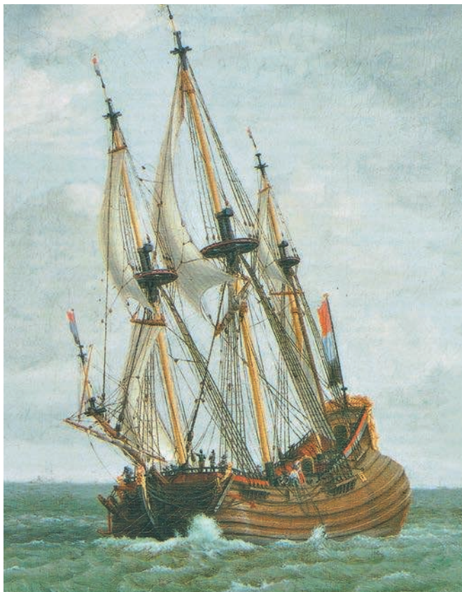
Fig. 4: A fluit, sailing close to the wind (detail), probably painted around 1680 by Claes Jansz. Rietschoof (Wegener-Sleeswijk 2003, p. 12, fig. 1).

In practice, technological transfer could only be successfully achieved through human mobility. Moreover guilds were not opposed to technological innovation (Epstein 2013, p. 55-57). According to Epstein (2009, p. 52), technological invention and innovation in the pre-industrial economy are still poorly understood. This is partly because of the difficulty in identifying the small-scale and anonymous innovations that dominated technical progress at the time. However, the problem is compounded