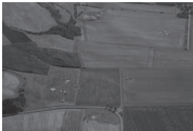
Figure 2: Gevensleben-Watenstedt. Hillfort and settlement „Hünenburg“. Airphoto summer 2008, from west.

Beside numerous small features (waste pits, etc.) the magnetogram (Fig. 3) shows large anomalies, which usually would be interpreted as geological patterns. But excavations have proven, that such anomalies are produced by cultural layers below the topsoil of some decimetres in thickness covering further small features (Heske et al. 2009). Some of these cultural layers extend up to hectares in size. Excavations could identify the numerous small features as the usual waste pits, storage pits, post holes etc. Unusually also graves were found within the settlement area. Furthermore in the places of high magnetic amplitudes conglomerations of stones have been found, which then could be interpreted as hearths or ovens (Heske 2002, 2007). Several groups of these ovens can be identified throughout the ca. 18 ha magnetogram.