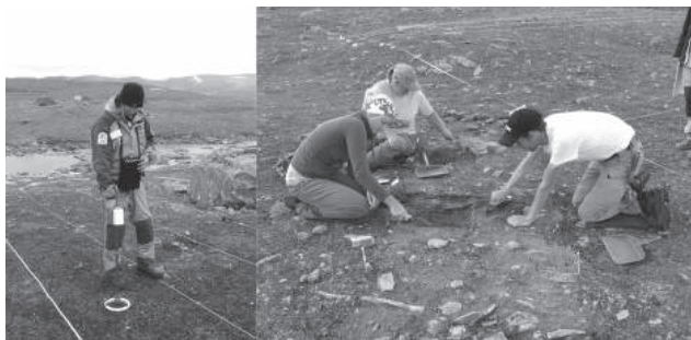
Figure 2. (left) Magnetic susceptibility survey with 0.5 m sample spacing. (right) Archaeological excavation of the thin cultural layer. Note the abundance of stones in the soil.

Another archaeological prospection approach which may be particularly suitable at this site is geochemical phosphate mapping. This method has enjoyed great popularity in Swedish archaeology since the 1930s (Arrhenius, 1935). Using the phosphate method as a prospecting tool is however not unproblematic for several reasons (Bethell and Máté, 1989; Crowther, 1997). A common problem is that of comparability of samples. Normally, when taking soil samples with a probe there is no warranty that the collected samples originates from the same layer. In the case of the Swedish mountain tundra region however, there most often only exists one soil layer. This suggests that this region may justify the use of the method. Another general problem of the method is the differentiation between recent and pre-historical phosphate depositions. In order to test the method a field phosphate analysis kit from Merck was used (Persson, 1997).