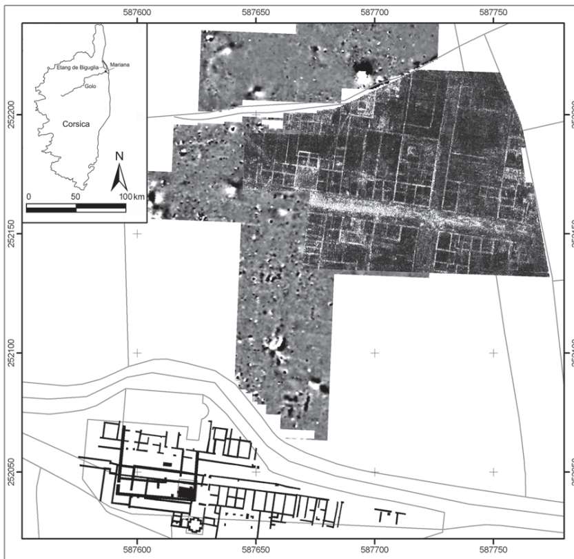
Figure 1: Results of the 2008 GPR survey (depth-slice 0.80-0.85 m), overlying the results of the 2006 fluxgate gradiometer survey. The results from the excavations around the Canonica are indicated in black.