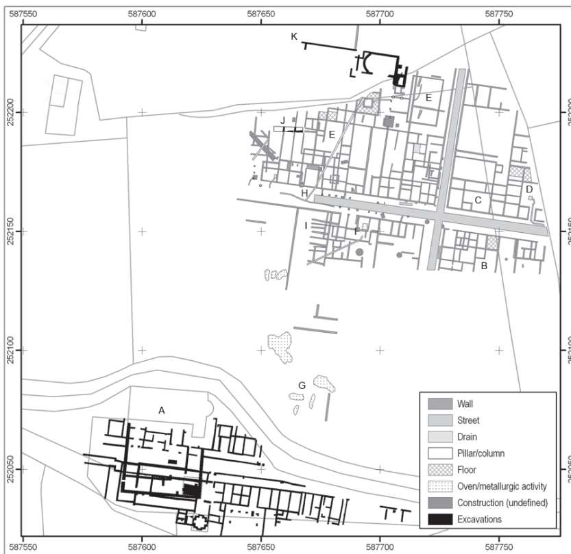
Figure 2: Interpretation of the GPR and gradiometer results, combined with data from the different excavations. A: excavations around Canonica, B-D: houses, E: baths, F-G: ovens/metallurgic activity, H: drain, I: different building phases of a house, J: test excavation, K: old excavations, georeferenced by means of the geophysical data.