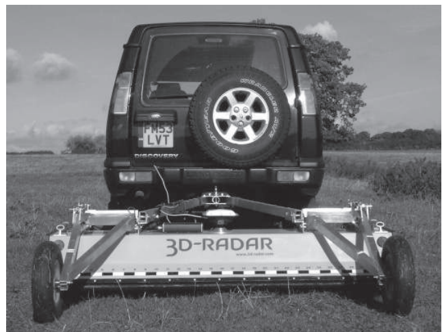
Figure 1: GeoScope B1831 air-launched antenna array mounted on a vehicle towed trailer for field survey. The precise location of the antenna is determined from a RTK GPS receiver mounted at the centre of the array.

This paper reports results from the field application of one such system: the 3d-radar, GeoScope using a range of multi-element array antennas with a cross line spacing between 0.055m (B1831) and 0.075m (B1823C, B2431). The GeoScope is a stepped-frequency radar system covering a bandwidth from 100MHz to 2GHz, recording from a maximum of 63 separate channels depending upon the interchangeable array antenna used (e.g. Binningsbø et al. , 2000). The use of an interspersed pattern of different sized elements across the in-line array should, in theory, allow the spatial sampling requirements approaching the Nyquist