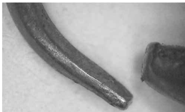
Figure 2: Both ends of earring 1742/24, with the hammer facets on the surface typical of hammering.

The five solid gold lunate-shaped earrings with a bent over the hoop are cast close to shape. The hoop is hammered to form the crooked pin (Fig. 2), and the other end is finished by polishing. The compositions of the gold alloys used in the fabrication of these five items have silver contents ranging from about 11% to 21%, and copper contents from about 1% to just over 2% (see results on Table 2). Thus, despite their stylistic and technical similarity, and internal consistency, they are made from a rather wide range of gold alloys. Interestingly, the silver to copper ratio is about 10 for all analyses. The variety of the Phoenician gold alloys was shown for the Gadir region by Ortega-Feliu et al. (2007).