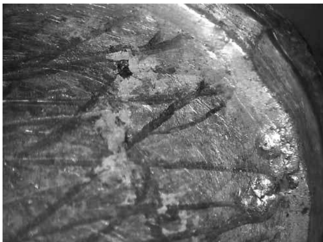
Figure 4: The bezel of gold signet finger-ring 1742/1476: the internal surfaces of the bezels are scratched.

It is of course possible that the copper was added intentionally; the effects of even small amounts of copper on hardness are relatively high, due to the c 12% difference in atomic radii between gold and copper (Hough et al. , 2009), while the effect on the colour is probably too low to have