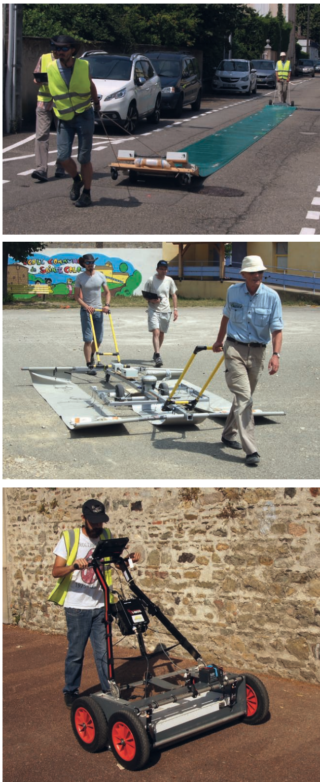
Figure 1. Geophysical devices used during the survey: a) Electrostatic “sliding carpet”, b) Electrostatic MP3, c) IDS Georadar (Stream X V8).

The surveys carried out in July 2020 were a first exploratory step in the use of geophysical methods for the study of