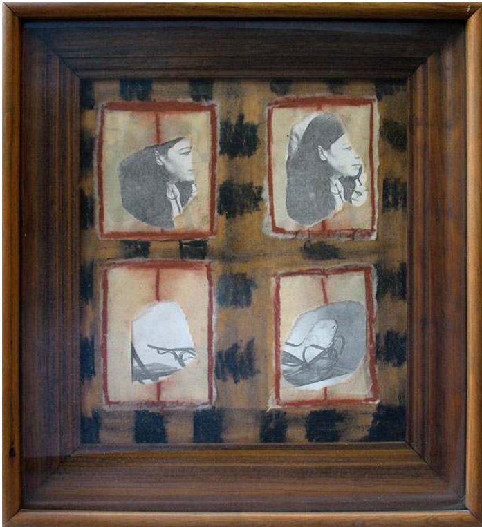
Magali Lara, Ventanas , collage with photocopies and pastel, 1977 25 x 22.5cm