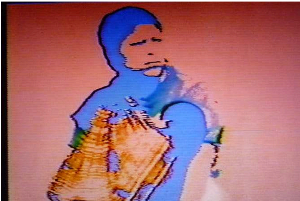
Fondo Pola Weiss-Edna Torres. Centro de Documentación Arkheia. Museo Universitario Arte Contemporáneo, UNAM