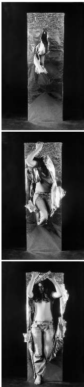
Casa del Lago, México D. F., 1975