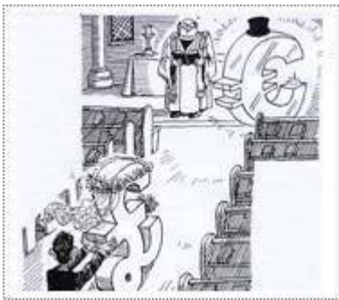
Figure 1. "Nearer to the altar" in The Economist Feb 27th – March 5th 1999