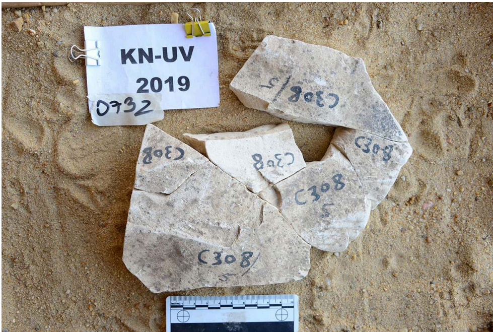
Fig. 3. Back view of relief fragment KNUV-732.