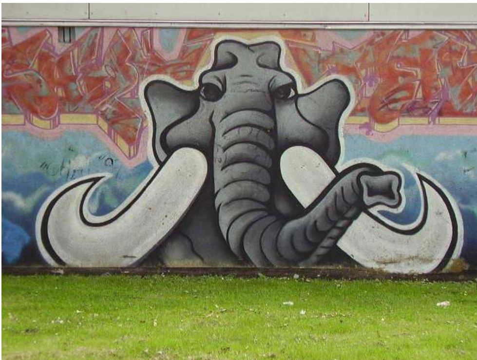
Figure 2. Respecting the unwritten rules of graffiti: a piece and character of the United Street Artists in Amsterdam West which has not been sprayed over for decades.