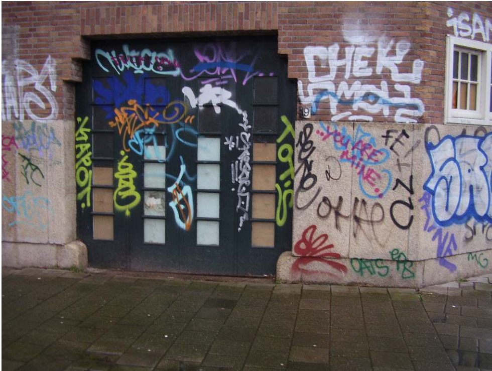
Figure 3. Disrespecting the unwritten rules of graffiti: writer's crossing each other's tags out.