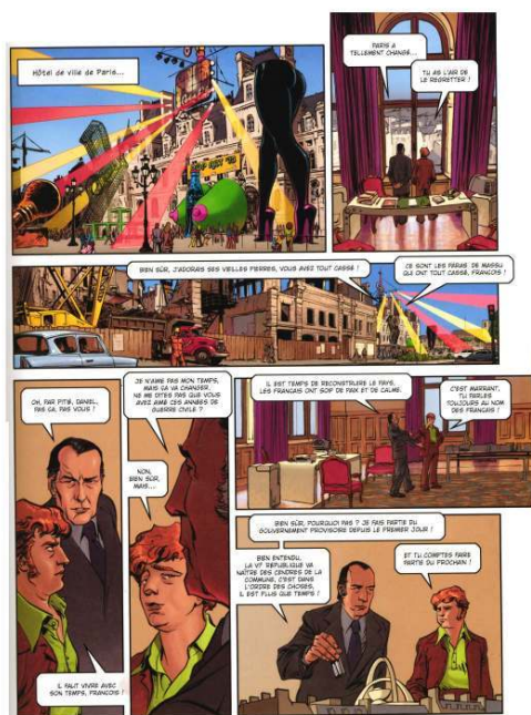
Figure 3: Jour J , volume 6, Duval – Pécau – Blanchard _ Mr Fab © Editions DELCOURT, 2011

with L'imagination au pouvoir ? France reverts to history under a centre-left government: the presidential candidate for the 6 th Republic is Mitterrand's minister Rocard.