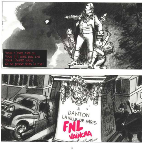
Figure 4: © Editions Casterman S.A./Tardi et Grange : <a href = "HYPERLINK http://www.casterman.com ">Editions Casterman</a>