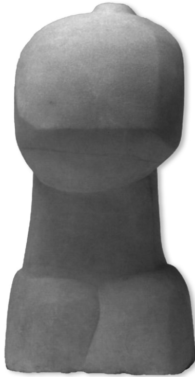
Fig. 11. Henri Gaudier-Brzeska, Hieratic Head of Ezra Pound (back view), 1914.

Pentelic marble, 90.5 x 45.7 x 48.9 cm. National Gallery of Art, Washington, D.C. Gift from the collection of Raymond and Patsy Nasher, 2009.72.1.