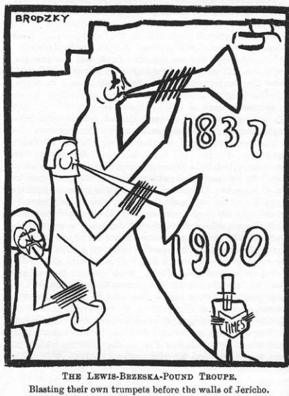
Fig. 3. Horace Brodzky, The Lewis-Brzeska-Pound Troupe. In Egoist 1, no.14 (15 July, 1914), 272.

directing the consciousness “to the precise point where there is a certain intuition to seize on” (Bergson 1963, 14, 672-674, 1371, 1399). Marsden celebrates images as the very stuff of which art is made: “Feeling, that is life, defines itself in terms of images: they are thinking’s raw material without which to work upon the intellectual process is meaningless ” (Marsden 1 September, 1914, 21-23). This belief accounts for Marsden’s predilection for the poetic