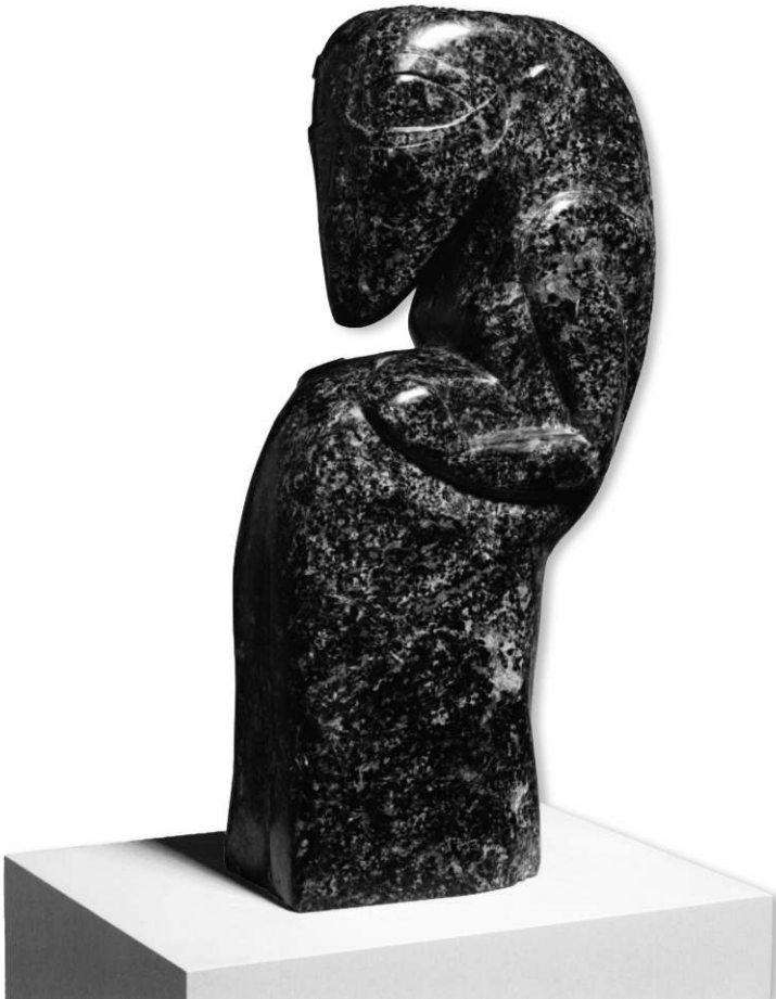
Fig. 4. Jacob Epstein, Female Figure in Flenite , 1913.