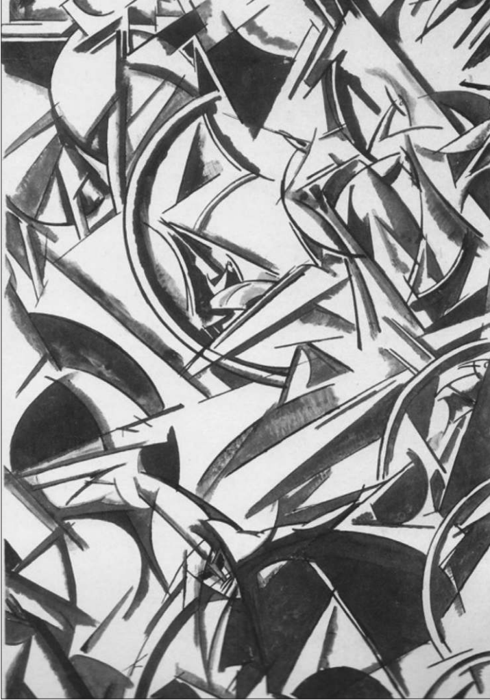
Fig. 5. Wyndham Lewis, Composition , 1912-13. Lithograph, 38.8 x 27.2 cm. In Wyndham Lewis, Timon of Athens (London: Cube Press, 1913). Private Collection. ©Wyndham Lewis Memorial Trust.

then asserts that the hard-edged linearity and interlocking patterns in Lewis's Timon drawings also express the artists' own "restless, turbulent intelligence" and rebellious "anger" in the face of a hostile but complacent cultural establishment (Pound 15 June 1914, 233-34). Pound affirms this critique in his earlier essay "The Caressability of the Greeks" by asserting that this "faculty of being moved is not criticism but appreciation" and that the "alliance" he wishes to craft "must be with our own generation