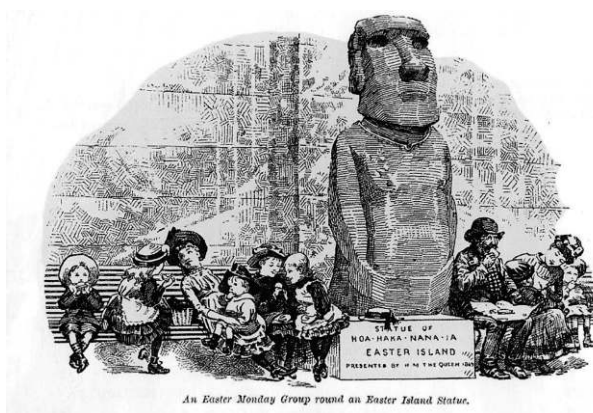
Fig. 10. An Easter Monday Group Round an Easter Island Statue.

Peabody Museum of Archeology and Ethnology, Harvard University, PM 2004.24.31852.