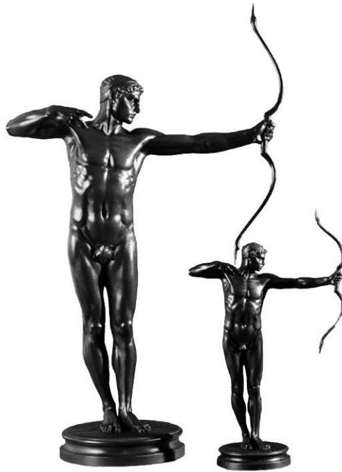
Fig. 6. William Hamo Thornycroft, two Teucers , 1881.

138-39, 200). Gosse also praised the high degree of realism achieved by Thornycroft through his modeling technique and the surface qualities of his finely polished, bronze statues, such as his two Teucers of 1881 (Fig. 6). Gosse described the New Sculpture's common ideal with reference to Thornycroft's sculpture as "modern in orientation and antique in form, blending the present and the past by profound understanding rather than by antiquarian study" (Gosse 1880, 183; Getsy 2004, 65). He even waxed eloquent on this paradigm by citing artist-critic John Everett Millais's claim that, had Thornycroft's Teucer been excavated from Athenian sands, it would have been celebrated as a marvel of classical antiquity (Gosse 1894, 201-02).