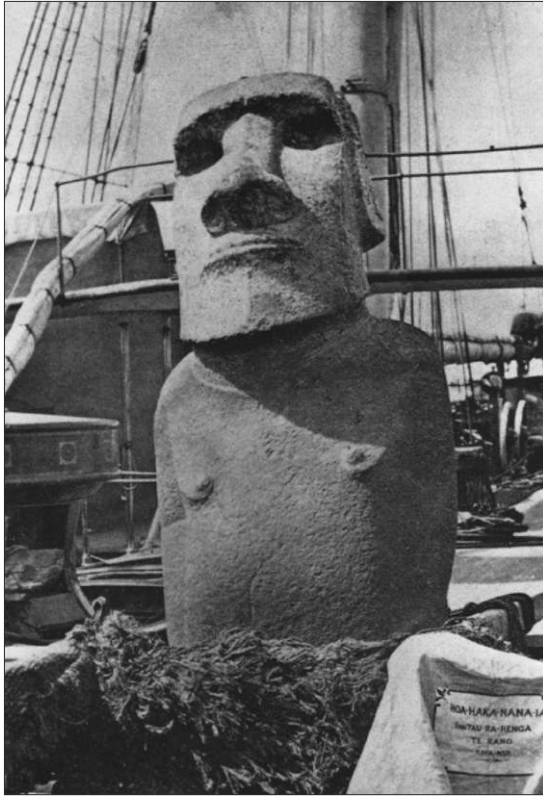
Fig. 9. Hoa Hakanani'a on board H.M.S. Topaze , Portsmouth, England, 1869.