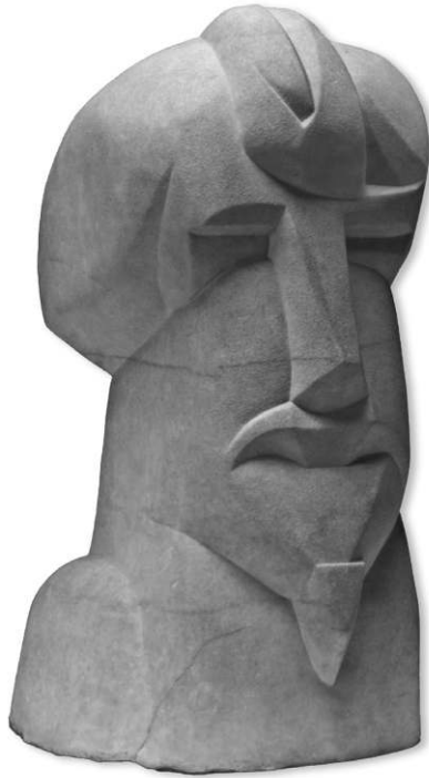
Fig. 8. Henri Gaudier-Brzeska, Hieratic Head of Ezra Pound , 1914.

Pentelic marble, 90.5 x 45.7 x 48.9 cm. National Gallery of Art, Washington, D.C. Gift from the collection of Raymond and Patsy Nasher, 2009.72.1.