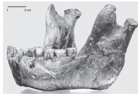
Fig. 2—Left lateral view of Tighennif 3.

Fig. 1a - Tighennif 1 ; b - Tighennif 2. Les photographies des originaux des mandibules de Tighennif ont été obtenues par Marcel Bovis en 1954 et offertes à Emiliano Aguirre par Camille Arambourg.