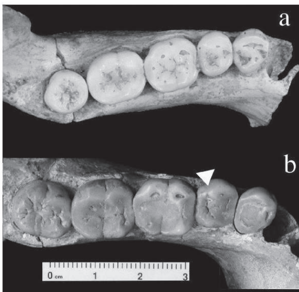
Fig. 5—P3 to M3 occlusal view of ATD6-96 (a) and Tighennif 2 (b). Note the primitive aspect of P3s in both specimens and the differences between P4s morphology. In Tighennif, the arrow head points the buccal delimitation of the buccal component of the talonid that TD6 fossils have lost (see text for explanation). Note also the size difference between the two mandibles.

TD6 hominins, Middle Pleistocene populations from Europe and H. neanderthalensis have lost the buccal component of the talonid that characterizes the hominin species from the Pliocene and the Early Pleistocene from Africa and Asia. This buccal component of the talonid is so conspicuous in Tighennif specimens that is delimited in the occlusal contour of the teeth by a characteristic buccal indentation (fig. 5). This conformation suggests that, despite belonging to the early Middle Pleistocene, Tighennif fossils would have kept the primitive state whereas the Early Pleistocene TD6 fossils would have started a different evolutionary path.