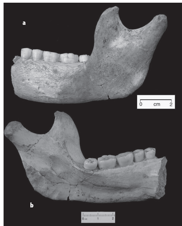
Fig. 3a—Lateral view of ATD6-96; b—medial view of ATD6-96.

Fig. 2 - Vue latérale gauche de Tighennif 3.