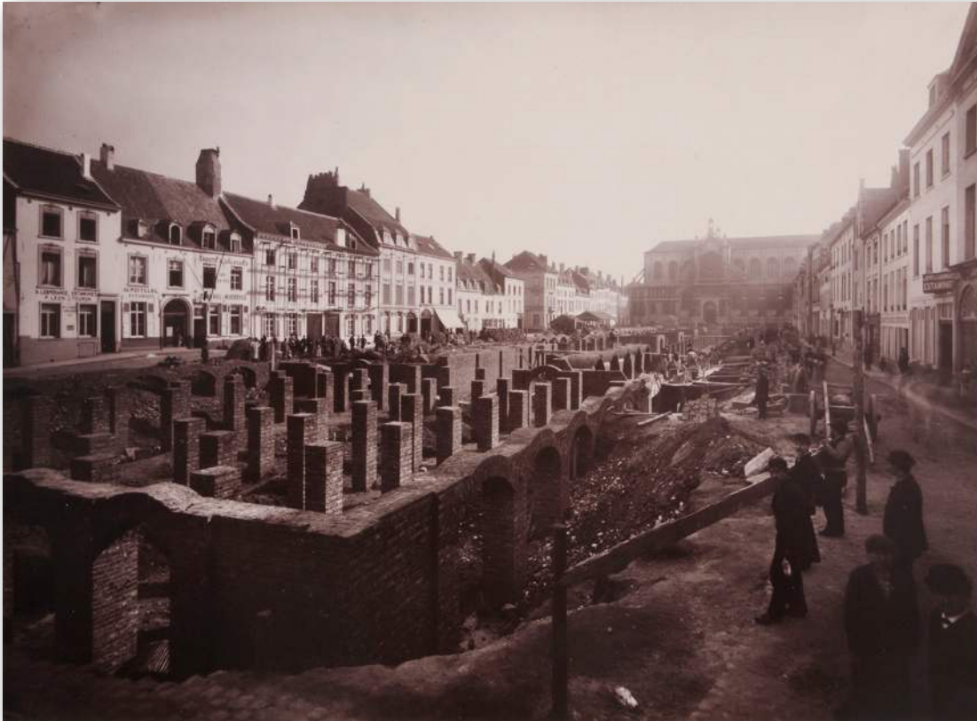
fig. 1: Jules G eruzet, 'Le nouveau March  aux Poissons', 1882, Fotomuseum, Antwerp