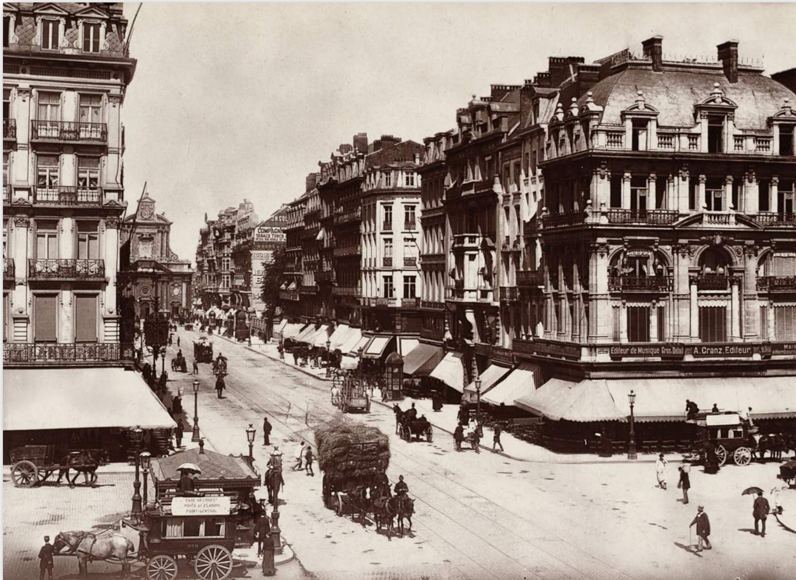
fig.3: Henri Tournay, 'Vue prise du coin du Boulevard Anspach vers le temple des Augustins', 1885, reproduction in the Bulletin de l'Association belge de Photographie , vol. 13, n°4, 1886, p.149.