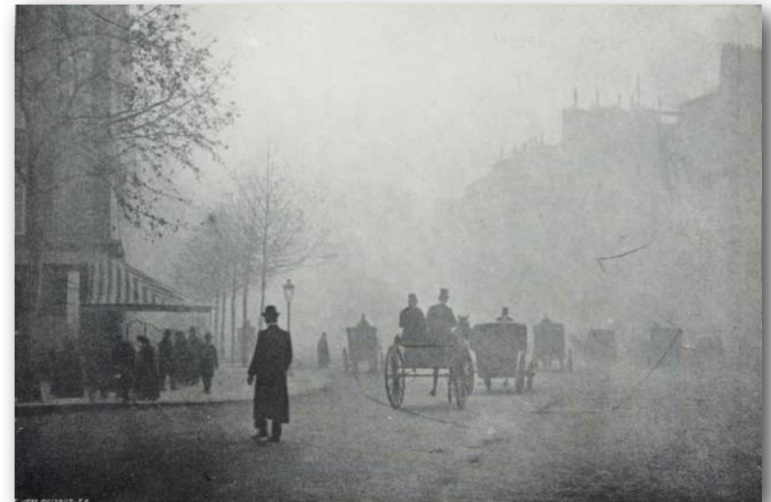
fig.7: Édouard Mahy, 'Brouillard', ca 1903, reproduction in the Bulletin de l'Association belge de Photographie , vol. 30, n°12, 1903.

17. The work of the Pictorialists shows that when they were interested in the city, they did not aim for the recognition of places in the image, but rather the visual translation of a feeling created by an atmospheric effect, for example. This is the case with Brouillard (fig. 7), a work by Brussels photographer Édouard Mahy, which was presented at the Belgian Photography Association fair in 1902. As its title indicates, it is above all the disappearance of the urban landscape due to the effect of this natural screen, which appears to be the object of this photograph. Like the Old Market photographed by Cumont, the boulevard was a pretext for the depiction of the surrounding atmosphere, with the fog providing a detachment from the realism of the urban setting. Instead of being situated, it is recreated by the photographer as the setting of a scene, in which passers-by and horse-drawn carriages move and disappear.