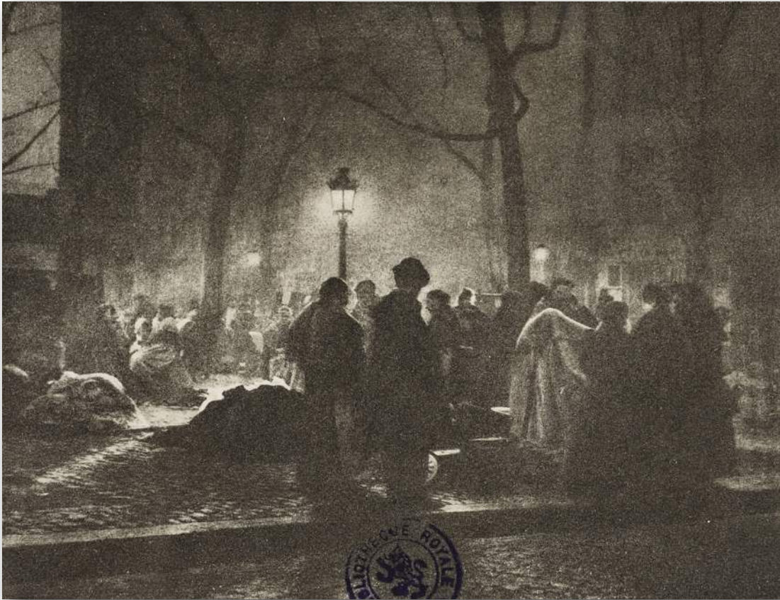
fig.6: Alfred Cumont , 'Vieux Marché', ca 1902, reproduction in the Bulletin de l'Association belge de Photographie , vol. 30, n°4, 1903.

17. The work of the Pictorialists shows that when they were interested in the city, they did not aim for the recognition of places in the image, but rather the visual translation of a feeling created by an atmospheric effect, for example. This is the case with Brouillard (fig. 7), a work by Brussels photographer Édouard Mahy, which was presented at the Belgian Photography Association fair in 1902. As its title indicates, it is above all the disappearance of the urban landscape due to the effect of this natural screen, which appears to be the object of this photograph. Like the Old Market photographed by Cumont, the boulevard was a pretext for the depiction of the surrounding atmosphere, with the fog providing a detachment from the realism of the urban setting. Instead of being situated, it is recreated by the photographer as the setting of a scene, in which passers-by and horse-drawn carriages move and disappear.