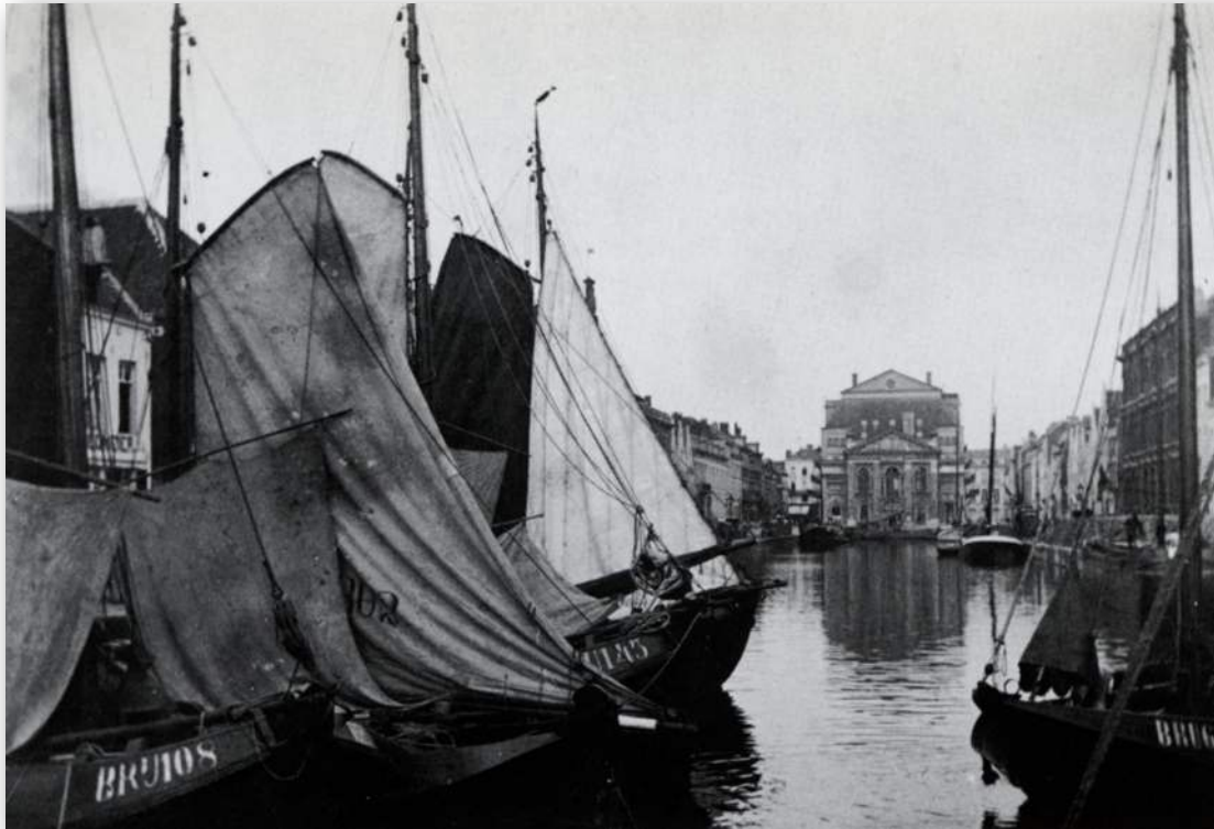
fig.2: Adolphe Lacomblé, 'Le bassin de l'Entrepôt', 1890s, private collection, Brussels

5. The Gêruzet brothers' representation of the new Marché aux Poissons depicts a precise moment in its construction. In accordance with the archival use of photography, the memorial function of this means of