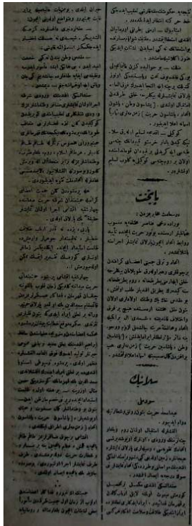
Yeni Asir, n° 1306, 18 Temmuz 1324 / 31 Juillet 1908, p. 1