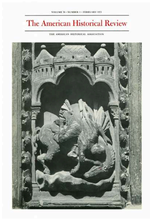
Fig. 2 – Front cover of The American Historical Review , vol. 76, n° 1 (Feb. 1971). Pride as a falling rider, ca. 1225. Chartres Cathedral. http://www.jstor.org/stable/1869773