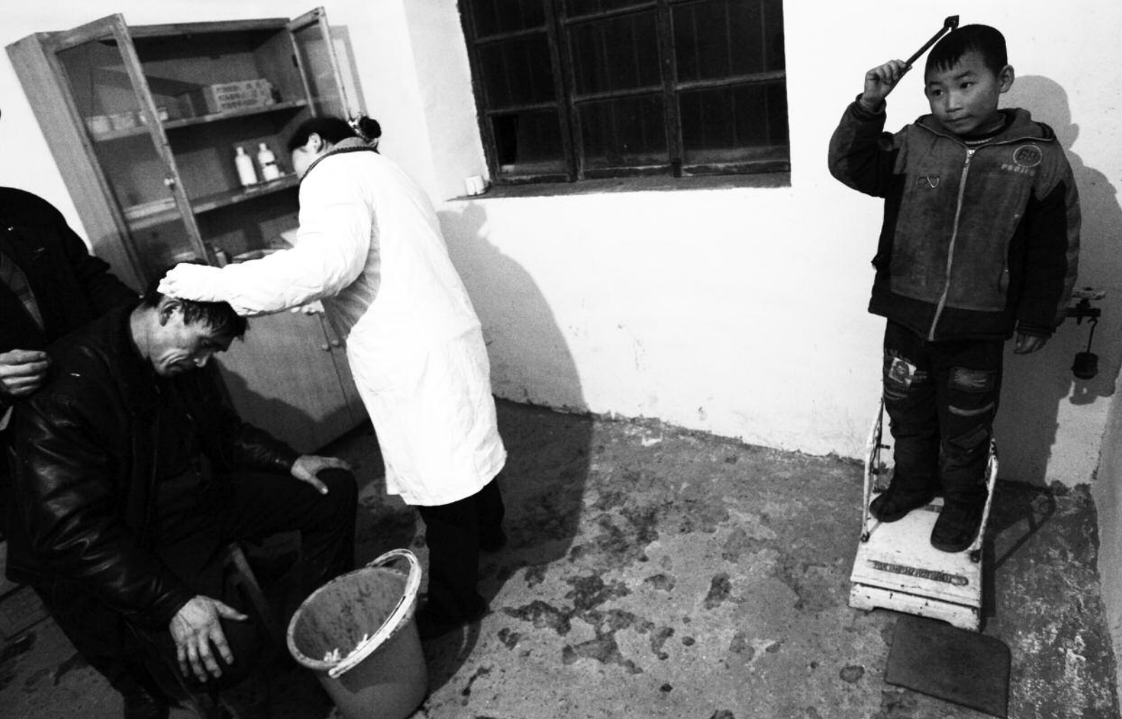
A doctor treats a patient's wound in the treatment room of the Chepan Township Hospital in Wulong County of Chongqing Municipality.