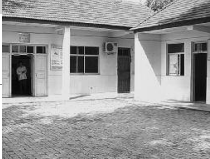
Village hospital, Henan Province

The first of these projects addressed the need to organise a local response to the problem of orphans left by HIV/AIDS in a number of villages, particularly in Shenqiu County, which has seen a large increase in the numbers left to fend for themselves or to depend on their grandparents. It would seem, moreover, that this county did not benefit from the attention that the provincial authorities reserved for Shangcai and, as we have seen, for the village of Wenlou in particular. According to many peasants from the neighbouring county, the latter village was turned into a showcase for the central government and foreign agencies in order to demonstrate that local authorities had really taken charge of the HIV/AIDS problem and its orphans. (55) So in late 2003, in one of these remote villages in Shenqiu County, (56) where a large number of tombs rising like small mountains amidst the fields shows how severely the AIDS virus has struck its inhabitants, the Taiwanese organisation contributed to opening a reception centre for AIDS orphans. After a careful search for trustworthy local partners to manage this project, Harmony Home made an arrangement with a peasant couple who agreed to shelter and feed about 20 orphans in their home.