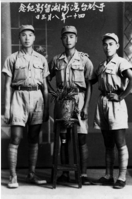
Three soldiers in their early 20s from Guangxi Province. They belonged to the KMT “Youth Army” ( Qingnian jun ). They were teenagers when they left school and home in 1944 to join the army and fight the Japanese. This picture was taken in Makung, Pescadores Islands, in 1952.