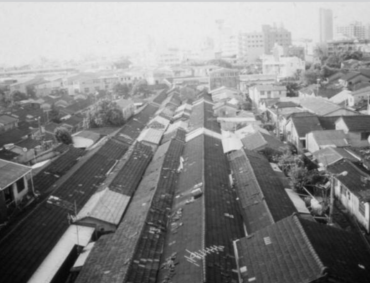
An aerial photo of juancun in Tainan City (1993).

Pescadores ( Penghu ) Islands. (60) Since military personnel were almost exclusively mainlanders, juancun were thought to be “enclaves” of Waishengren even though many residents were native Taiwanese women who married the officers. Most juancun have been demolished since the 1990s to make way for city planning and the construction of new neighbourhoods. The demolition of juancun sparked a wave of nostalgia, calls for heritage preservation, and production of the TV dramas mentioned earlier. There exist a large number of theses and dissertations on individual juancun communities, but only a few were published. Two of the earliest monographs were Shang Tao-ming’s study of the Le-chun New Village in Tainan in 1995 and Chao Kang and Hou Nien-tsu’s research on Chung-tai New Village (pseudonym) in Tai-chung in the same year. (61)