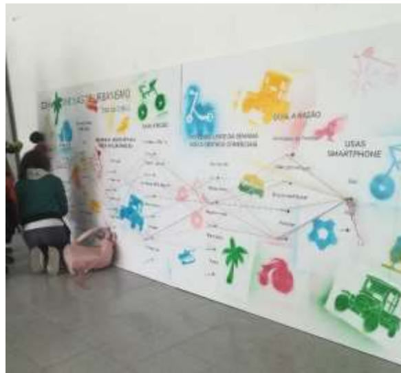
Figure 3. Students interacting with a structure available in the school lobby prior to the labs to collect ideas from the broader school community

transforming learning into a more organic process. This is relevant, as the recent education legislation in Portugal requires more curricular flexibility and considering the particularities of the community (Decree-Law 54/2018). Teenagers also benefit from a better urban education or territorial capacity building as “a way of giving people some certainty and of embodying knowledge rooted in their spaces, the ones they create and know at the same time that they create themselves, as individuals and citizens” (Estrela & Smaniotto, 2019: 48). To build more inclusive, safe, resilient, and sustainable cities, policy makers must commit to building teenagers’ capacity and overcome stereotypes.