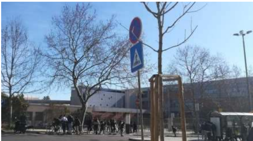
Figure 2. Students hanging out in the bus shelter and leaning on the sharing-bike station