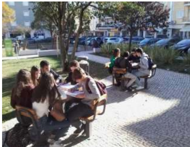
Figure 1. Students were taken to a discovery trip through public spaces in Alvalade

Note: Here they are discussing and analysing their field notes.