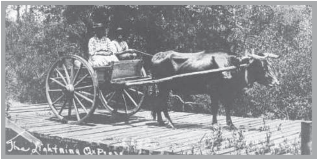
Fig 5: A Picture of an Ox Drawn Cart

Technologies specific to Kisumu Asian and African cultural groups were distinguishable in the townships pioneer period. The fabrication of technology products of the pre-industrial Indian society was occasioned by the making of Indian carts for local transport work, which by 1913 had become an important business in Kisumu (AR 1913/14). Indian carts on their derivatives were used in virtually all aspects of transportation (Figure 5). Tied to the use of water to power flourmills was another important pre-industrial technology input i.e ‘the making of ‘gur’ the black jiggery from sugar cane. 34