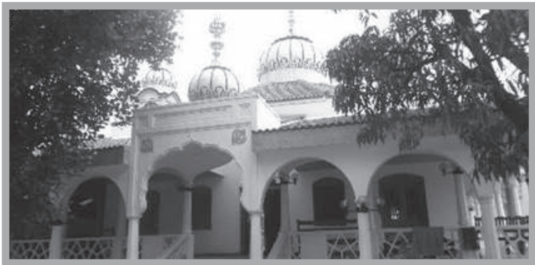
Fig 2: A picture of the Siri Guru Singh Sabha Kisumu (Sikh temple) - foundation stone laid on 21 December 1913. (Daily Nation, 20/12/2013)

The landscape has been one of two successive 'Indian bazaars', Islamic and Khoja mosques, a variety of temples (Figure 2), the ubiquitous shop cum residence, multifamily tenements, engineering workshops, schools, hostels, hospitals, cemeteries and a crematorium. Covering a large and continuous area of Kisumu, this 'Asian zone' in town was segregated on the basis of specific Indian communities. 17