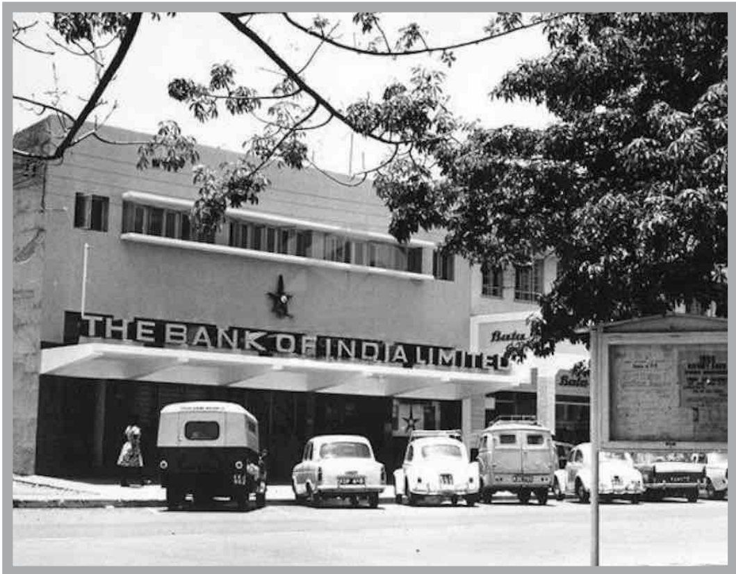
Fig 1. A picture of bank of India established in Kisumu as early as 1913

The Second World War slowed down the growth of Kisumu, resulting in a tremendous demand for Asian housing, business premises and factory sites. The greater demand was in the Asian sector because at the time urban real estate investments were essentially an economic relationship between Kisumu's Europeans and Asians and excluded Africans. Most significant for Kisumu was the opening of the National Bank of India branch office in Kisumu in April 1913 15 (Figure 1).