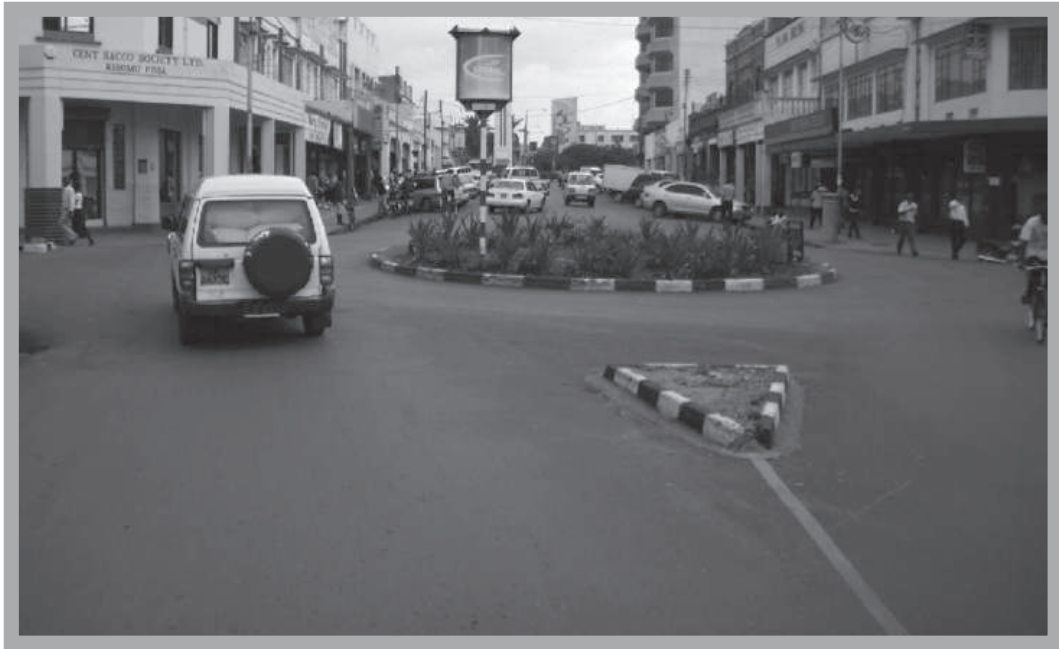
Fig 7: A picture of Asian Business District Showing Well Planned, Modern Environment, Wide roads and Some Landscaping on the Roundabout in Kisumu.