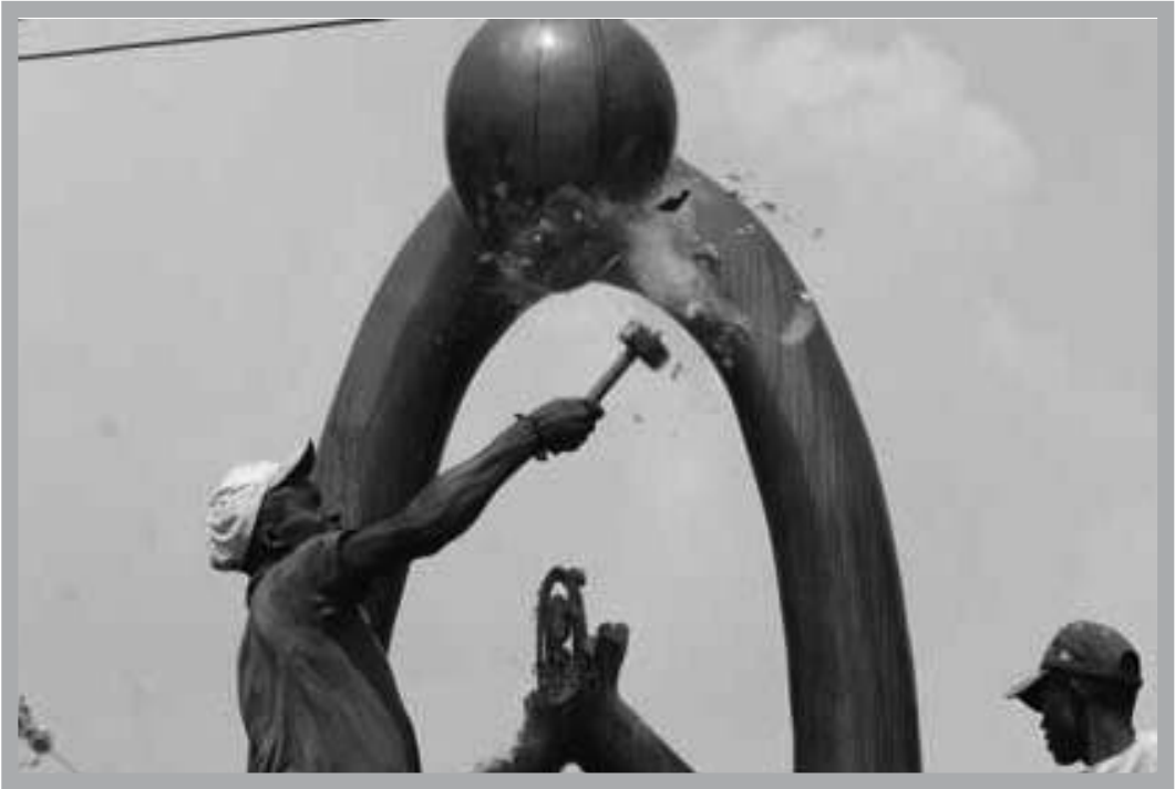
Fig 9. Demonstrators attack a sculpture erected by the Sikh community in Kisumu town