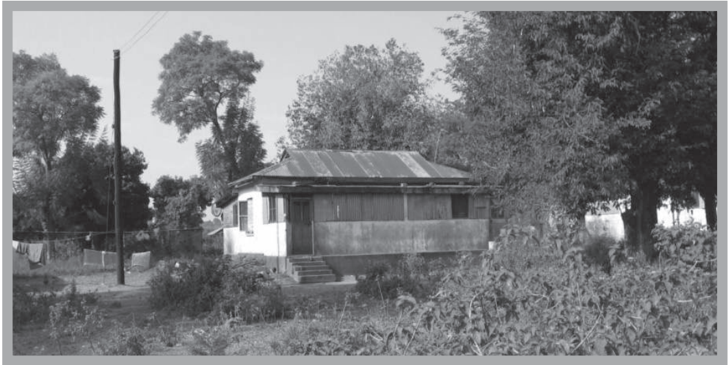
Fig 3: An Indian House in the Rural Village in Kisumu

Different sections of Kisumu's urban structures reflected different urban morphologies, which in turn were made up of distinctive architectural styles. These designs were traceable from an earlier pre-railway, colonial period or of the more recent international style. Architecture akin to that of pre-colonial period could be found in rural Kisumu (Figure 3), and in parts of the inner peri-urban Kisumu. The shop cum residence of Asians was copied by Africans in the peri-urban and rural areas in Kisumu and in many small towns in Kenya. The 'environment aesthetics' related well to the visual impact of built forms and the environment. 18