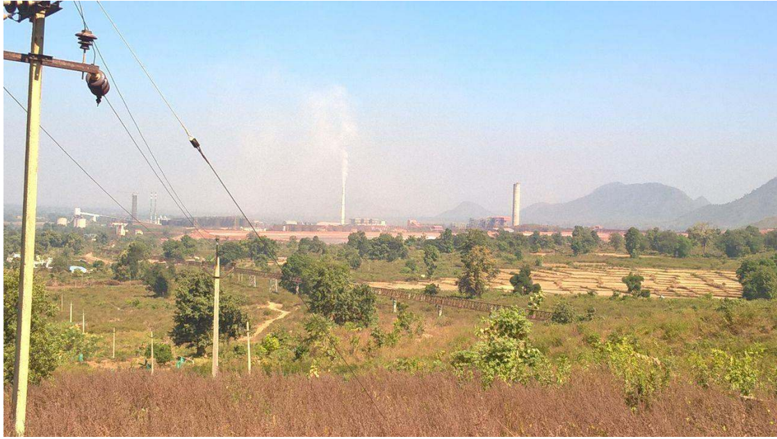
FIGURE IV – Vedanta Mining Complex

as well as affecting their indigenous livelihood. The state is getting plenty of revenue and has fervently promoted mining as a sure way to curb unemployment among the youth in Odisha. Middle class ambitious youth and entrepreneurs from different parts of the state have flocked to these areas and have found a quick way of making money. But the mining project areas are inhabited by tribal people – they live and breathe around these mines.