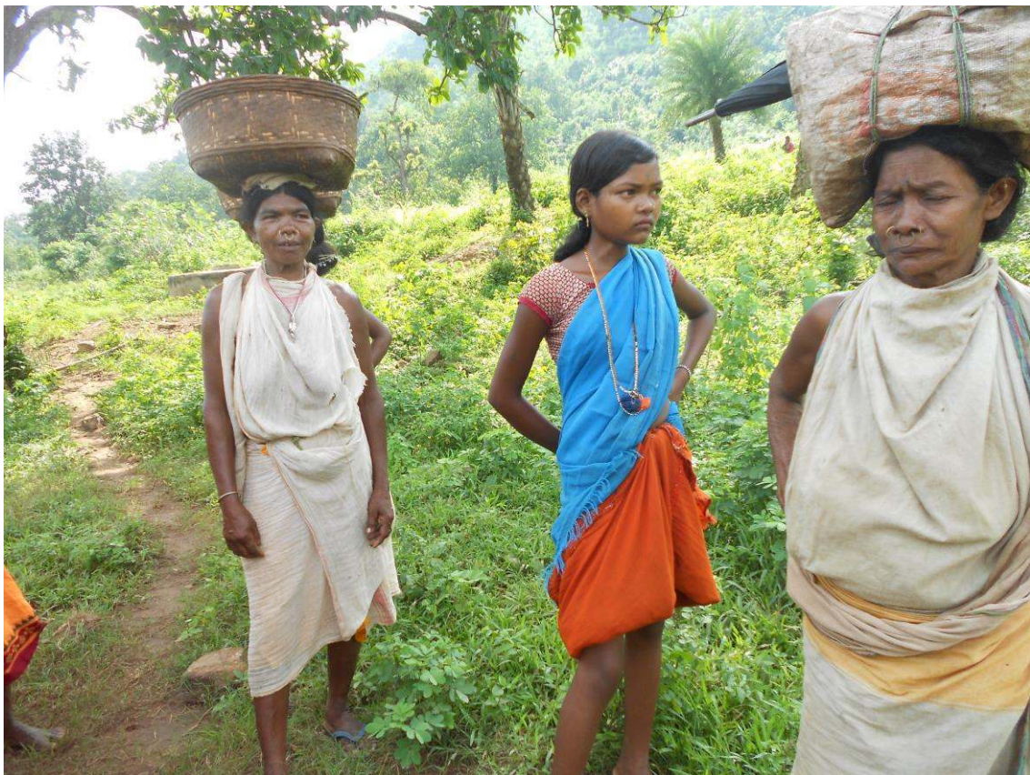
FIGURE II – Kondh Women

Niyamgiri provides us food, the basic necessity of life. No one will die of starvation – whenever you go over the hill you will get plenty of food there. He brings rainfall, provides us water, fresh air, and also provides a habitat for different kinds of animals. If the hill is cut off and we aspire for progress, he will not support us, and finally the land will get barren and we all will die. (personal conversation, May, 2015)