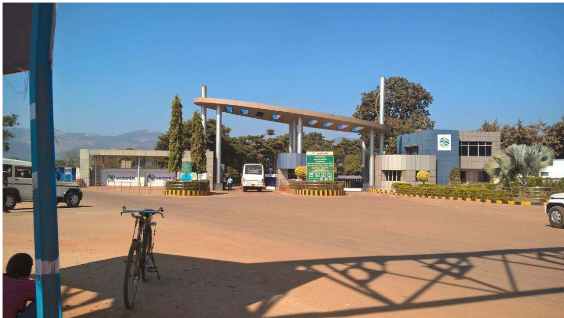
FIGURE IV – Vedanta Factory