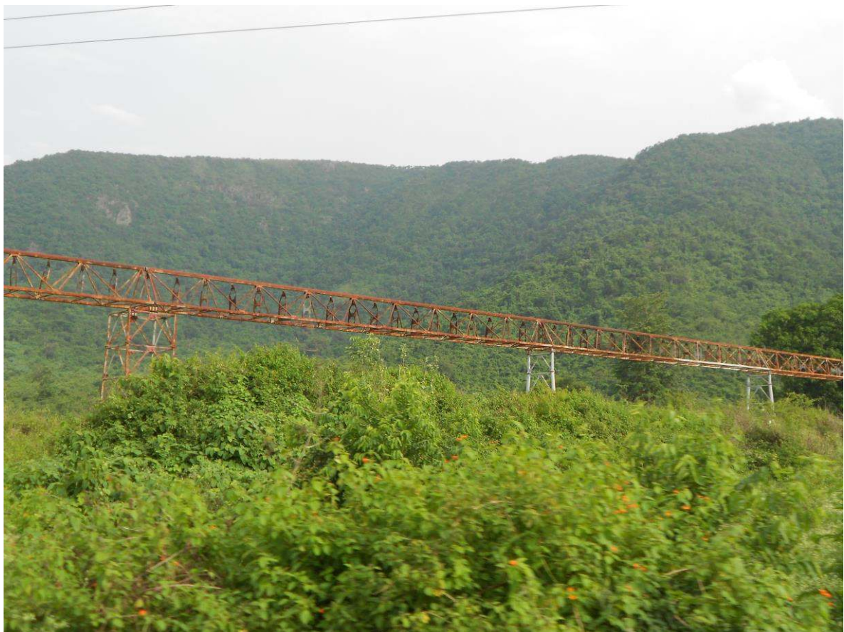
FIGURE III – Factory Belt across Niyamagiri

The state of Odisha, especially the southern belt comprising of Koraput, Balangir and Kalahandi districts (KBK), is endowed with 1733 million tons (70%) of the total bauxite resources of the country. In the post-liberalization period, this mineral resource has attracted many multinational corporations both from within and outside the country, dragging this state into the globalization arena. The state wholeheartedly supports these initiatives, attracting huge revenues from the mining. During the 1992-1997 period, bauxite resources in Odisha have pulled in $20.5 billion dollars. Vedanta Aluminium Ltd has set up and is operating a one-million ton alumina refinery at Lanjigarh, in the district of Kalahandi, based on a Memorandum of Understanding (MoU) signed with the Government of Odisha which stated that up to 150 million tons of bauxite for the plant will be supplied from nearby Niyamagiri hills (Vedanta report, 2012). However, with the protest of the local Dongria Kondhs, the Union Ministry of Environment and Forest (MoEF) has disallowed bauxite excavation at Niyamgiri.