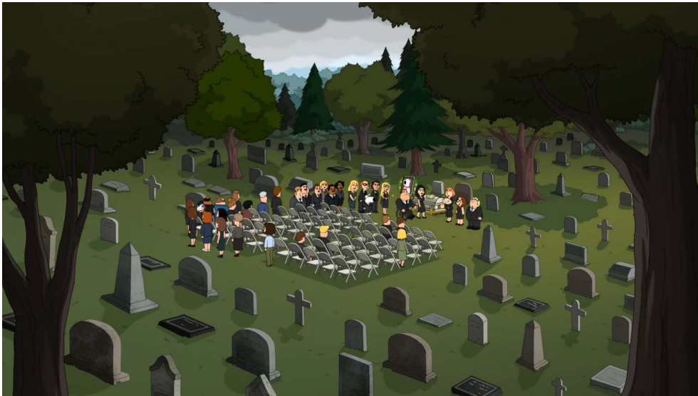
Fig. 1: Friends and family gather for Brian’s funeral. Screenshot from the Family Guy episode “Life of Brian” (Netflix Austria).