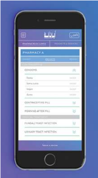
Figure 8: Appzakhana, Product Detail Pharmacy. Valerie Arif