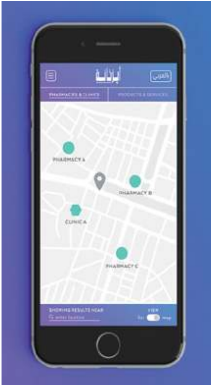
Figure 6: Appzakhana, location map. Valerie Arif