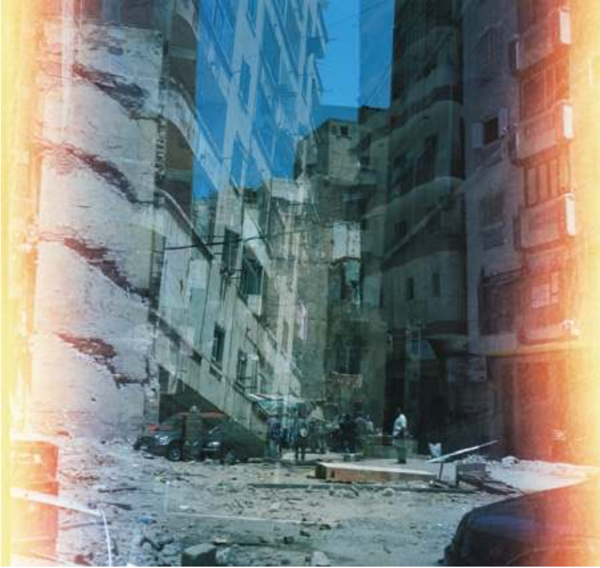
Figure 2: Remains of the Leaning Tower of Azarita. Hanaa Safwat, June 2017