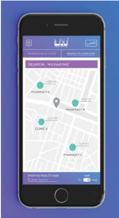
Figure 10: Appzakhana, Search Example. Valerie Arif