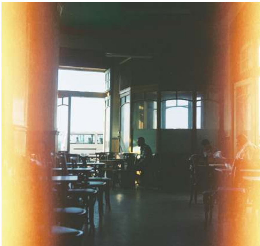
Figure 3: El Togareya Coffee House. Hanaa Safwat, June 2017

(Newcomb 2006). As a result of the financial burden of marriage and the intrinsically linked change in social space, young people are – slowly – challenging the familial ethos that ties sexual activity to marriage, thereby provoking the authorities and the state to respond. If one keeps these dynamics in mind, it can be seen that the price increases following the floating of the pound and the lack of products linked to sexual activity are only one of the barriers for young women wishing to make self-determined choices with regard to their sexual health. The intersecting socio-economic circumstances I have described above may have created a situation that is even more sensitive in relation to women's sexual health and women's claim for self-determined choices in this area.