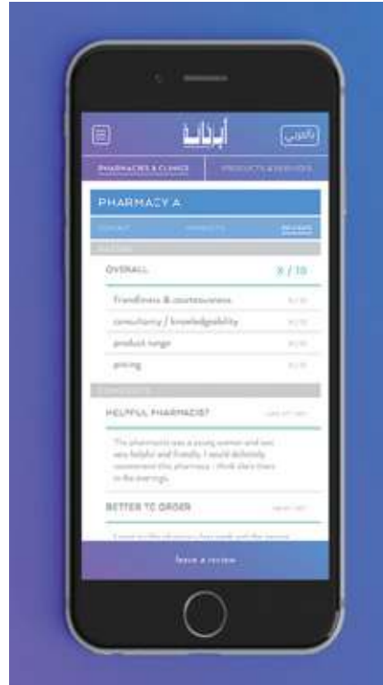
Figure 9: Appzakhana, Rating Example. Valerie Arif

prescription medication, feminine hygiene, and family planning services. The basic feature of the application is a customer rating of pharmacies on the basis of intrusiveness, consultancy, the gender of the pharmacists, locality, and price, and it includes a comments section. The rating and comments system followed by customers for customers helps circumvent governmental and societal regulations on the 'right' conduct of life and women's bodies. In short, the application seeks to separate decision-making processes and access to information from governmental or social regulation and is restricted through its customer-led verified information.