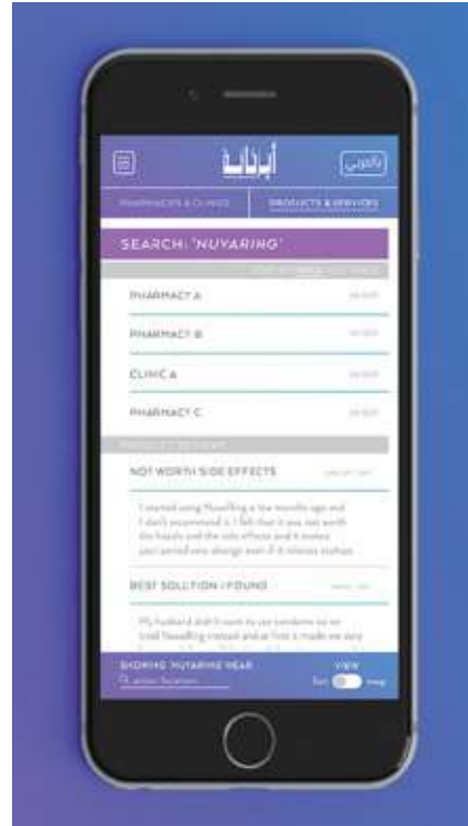
Figure 11: Appzakhana, Search Detail. Valerie Arif

and advice is offered (see Angus.ai, realeyesit.com, or imotions.com). Here, sales figures and financial profit are used as (admittedly not unproblematic) bait for possibly offering solutions for women in precarious situations, notwithstanding their social status, personal means, religion, marital status, or any other variable.