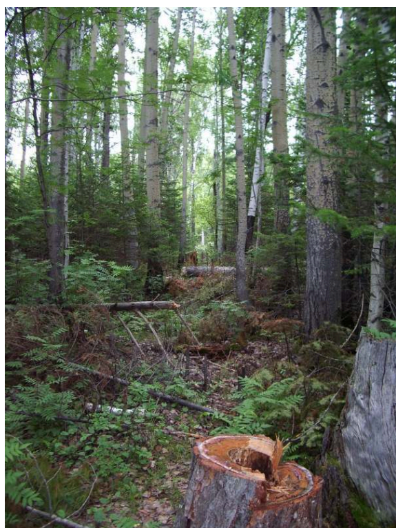
Figure 5. Transect for pipeline