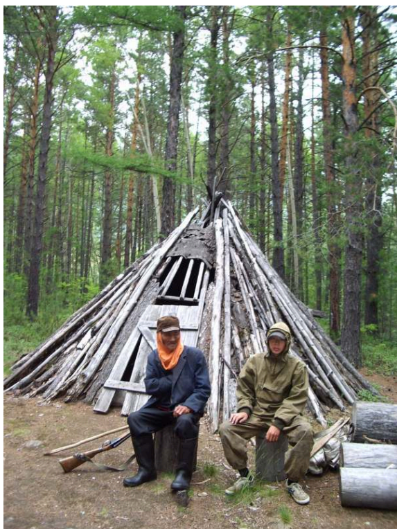
Figure 2. Bark tipi ( golomo )