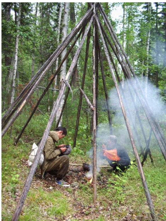
Figure 3. Conical Frame ( guluvun )