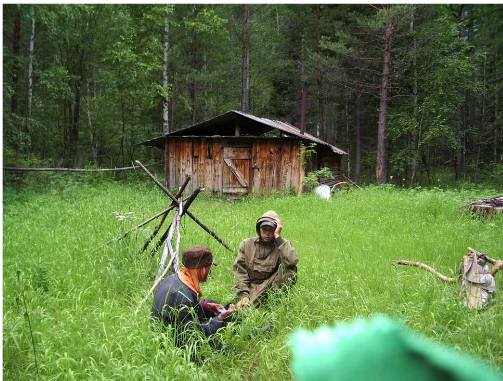
Figure 4. Russian Style Hunting Cabin