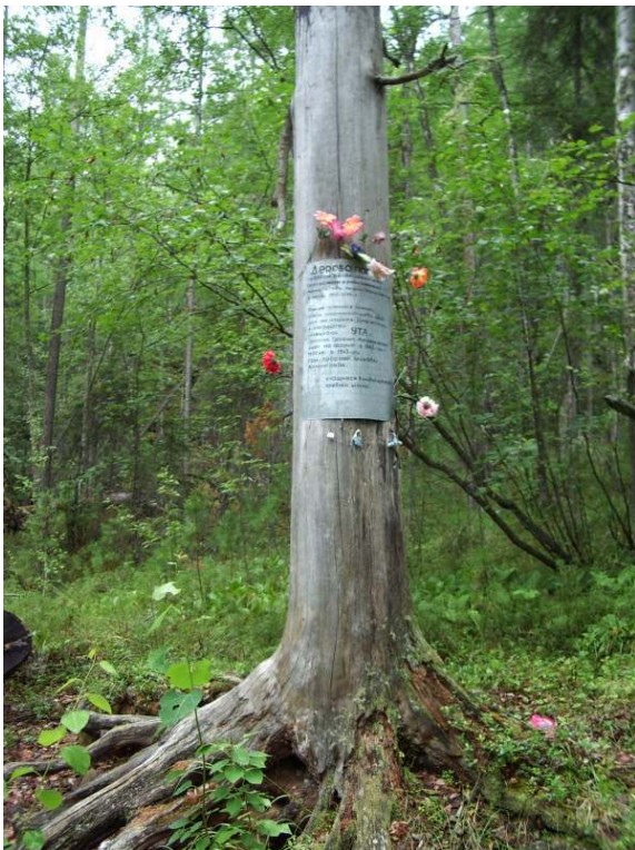
Figure 1. Memorial Tree

“Ecological Trail” (Ru. èkologicheskaja tropa ), a path leading from the village of Holodnaia near the north end of Lake Baikal into the taiga, and eventually to the Tree and beyond. Holodnaia is considered an “Evenki” village, the Evenki being one of the indigenous peoples of the Russian Federation 1 . As a geographer interested in indigenous rights to land, I am intrigued by the way indigenous peoples are re-making and performing places 2 , how they are working landscapes actively both to encourage a sense of territorial belonging among their youth and to communicate their assertions of territorial rights to outsiders. The Tree and Trail exemplify such place-(re-)making and territorial assertions; while the guided hike I consider a choreographed performance of these claims.