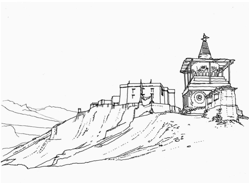
Figure 4. Tsarang monastery and chörten, sketch

occurred over the last 30 years; that is, since the opening of the region for tourism. Since then, a couple of academic reports have been published about Mustang primarily focusing on its Buddhist culture and its temples. What makes Harrison's work stand out is the broad perspective on the subject, the big picture that is based on the vernacular architecture rooted in and developed in correspondence with the landscape and climate, and, above all, the long stretch of time he covers with his documentation. Mustang Building is a modest title for this book which is, of course, at the same time a documentation of changes and a documentation of loss. Like any other book that deals with vernacular architecture and traditional systems, it is full of references to buildings and technologies which might be gone or even forgotten soon. Mustang Building is a book about a fading tradition. It is thus an invaluable contribution to our attempts to preserve at least our knowledge of an architectural tradition where physical preservation is no longer possible. It is above all a remarkable book about Mustang architecture drawn and written by a dedicated architect.