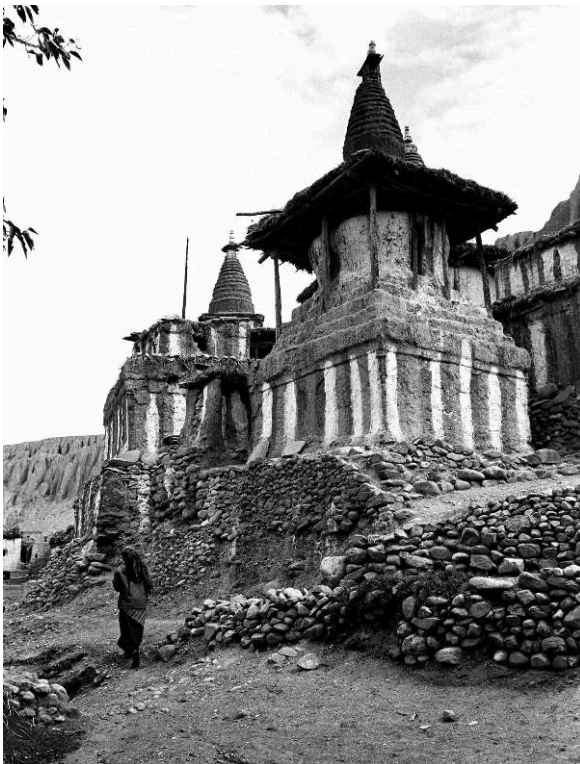
Figure 3. Tangye chörten