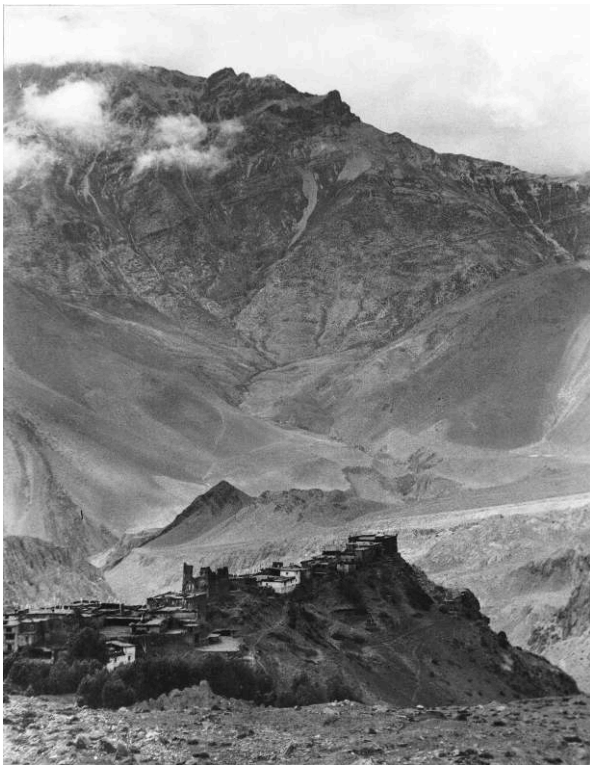
Figure 2. Dzar from the east, 1996